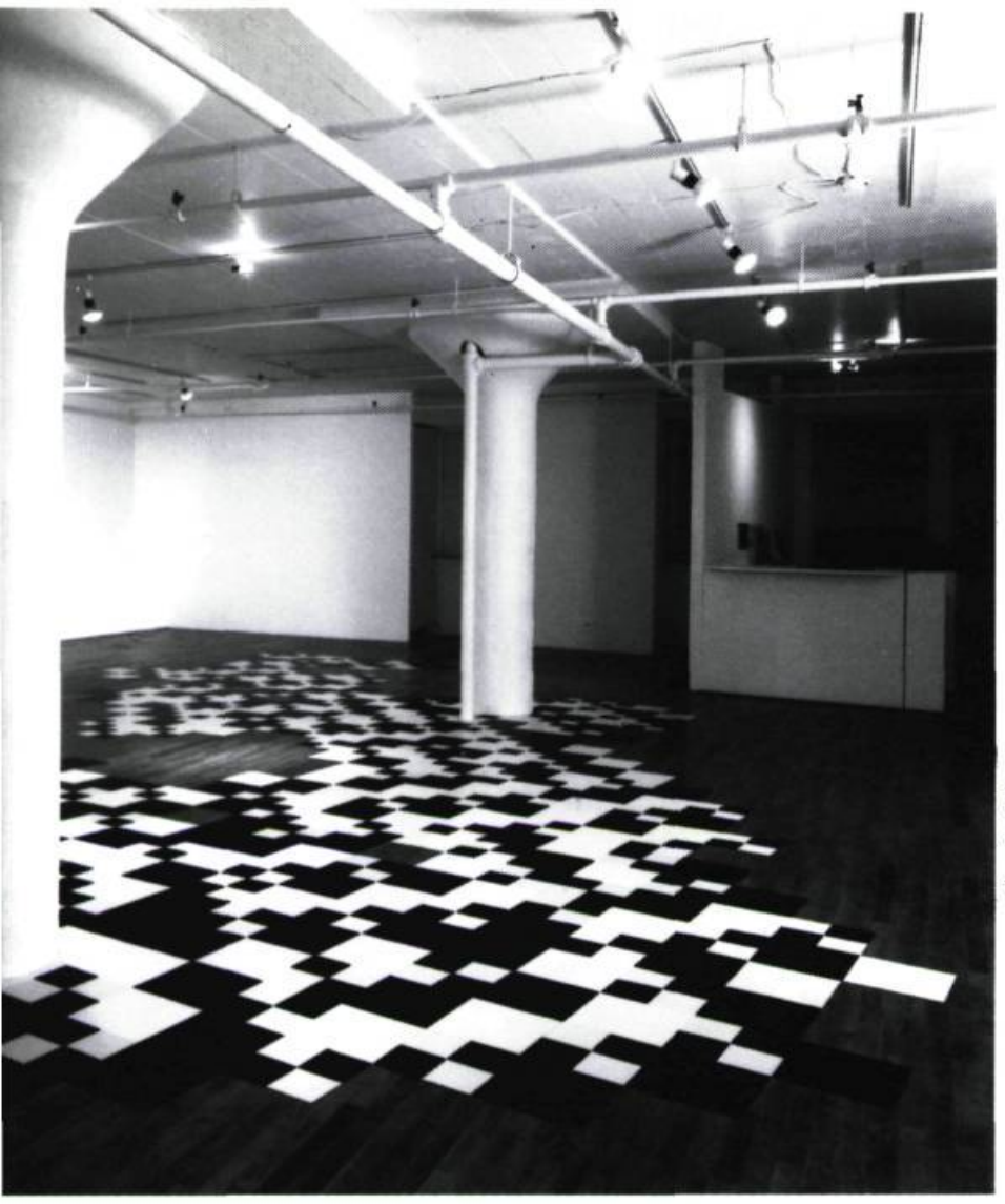
Vue de l'installation : Arlene Stamp, Aleph, tuiles de vinyle au plancher. Au mur, à gauche : Yvonne Lammerich, pièce en verre.

the black and white becomes transparency and shadow. Here eleven glass panels are slanted vertically at an angle adjacent to the wall and set into a diagonal white base that, in fact, repositions the wall onto another plane, dislocating the perceptual corner of the architectural space. The material transparency of the glass has been violated by opaque areas sand-blasted onto the surface and inscribed with white china-marker lines. It is these areas that are, in turn, reflected as obliquely cast shadows from the leaning surface onto the supporting wall. In a syncopating rhythm, the black/shadow markings pulsate in a chaotic configuration that disrupts the predetermined monocular static position obscuring the rigid grid system. The shadows, like the painted black textured punctuation marks in Lammerich's other piece, act as destabilizing elements forcing the observer, through a type of osmotic displacement, to create a shift in the perception of their own spatial location.