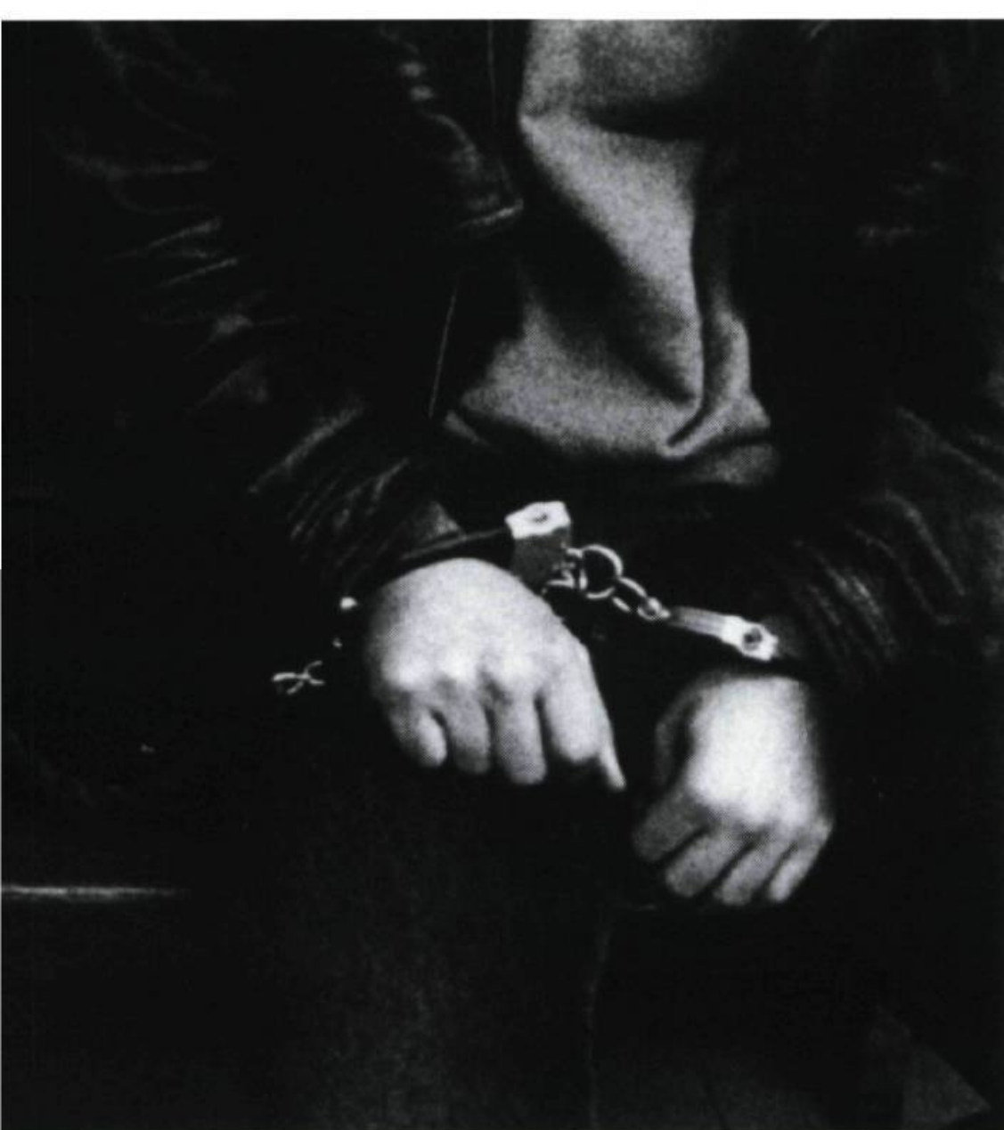
Raymond Depardon, Caught in the Act (Délits flagrants) , France, 1995.