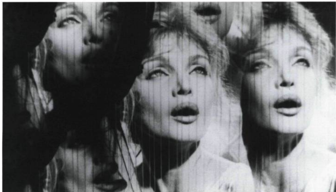
Kiarostami, Kimiavi, Breillat, Depardon, Longuine, Denis, Costa-Gavras, Ruiz, À propos de Nice, la suite , France, 1995.

and videos here as opposed to Montréal, where we have 225. In Montréal we have eight theaters and three or four outdoor venues, which I eventually want to do in New York — in Union Square or other neighborhoods. This all needs to be explored.