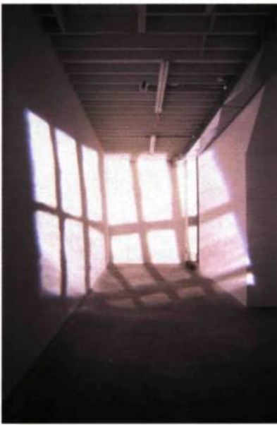
Ian Carr-Harris, 137 Tecumseth , 1994. (Projection # 1).