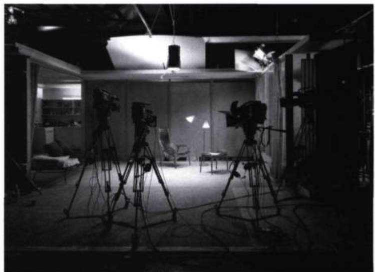
Stan Douglas, Set for Win, Place or Show (East View) , 1998. Colour photograph.