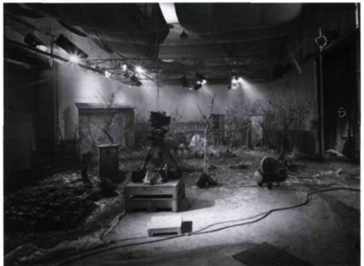
Stan Douglas, Historic Set for Der Sandmann at DOKFILM Studios, 1995. Colour photograph.