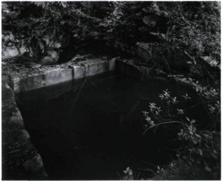
Stan Douglas, Marble Quarry at Hisnit Inlet, extrait des séries Nootka Sound, 1996. Colour photograph.

Hors-champs (1992), the earliest work in the exhibition, uses an irreconcilable split of vision as an emblem of the socio-political divides of the middle of this century. Projected on one side of a screen bisecting the room is a 1960s-style television presentation of a jazz quartet improvising upon a composition (Albert Ayler's 1965 Spirits Rejoice ) that includes references to gospel and the heraldic Marseillaise. Since the program was shot with two cameras, there exists an exact excised double of the edited program, looser and more revealing, which is projected simultaneously on the other side of the screen. The American musicians were all connected to the Free Jazz movement in France, which was in turn associated with the socialist student movement and, in the United States, with Black nationalism. In the installation, Douglas establishes a structural duality in which one's physical inability to view both