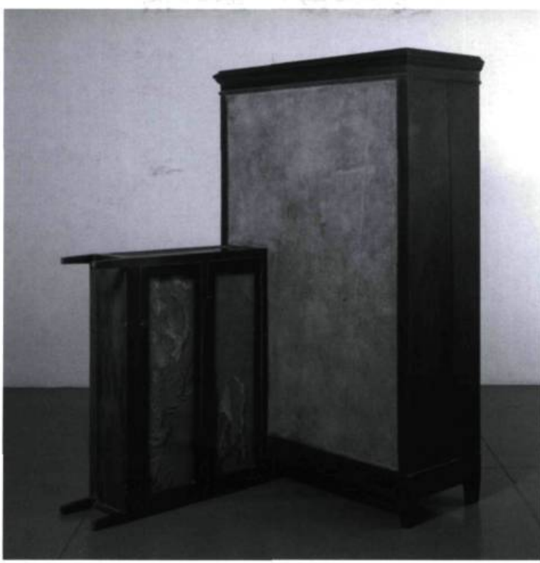
Doris Salcedo, Untitled , 2001. Wood, concrete, glass, fabric and steel; 203, 5 x 170 x 127 cm.

mic trace, the return of what was forgotten, in other words, an action by a past that is now forced to disguise itself." This idea is borne out by the journalistic reality typical to many situations of political conflict. It delivers the general notion that history is "cannibalistic", and that "any autonomous order is founded upon what it eliminates". 3