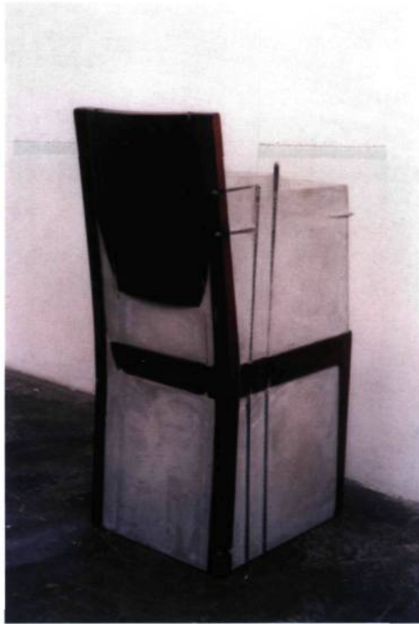
Doris Salcedo, Untitled , 2000. Concrete, wood and steel, 95 x 44 x 47 cm.

wall surfaces underscore the undoing of previous construction, referencing not only the immediate stages of physical assemblage, but also alluding to the practices of neo-plasticism and, more broadly, creating a history painting in the post-modern sense. With reference to the abstraction of Modernist paintings, where resemblance to subject was set at a comparative remove from the process, Ketter literally removes the subject from the surface of his paintings as a step in the process of creating his images.