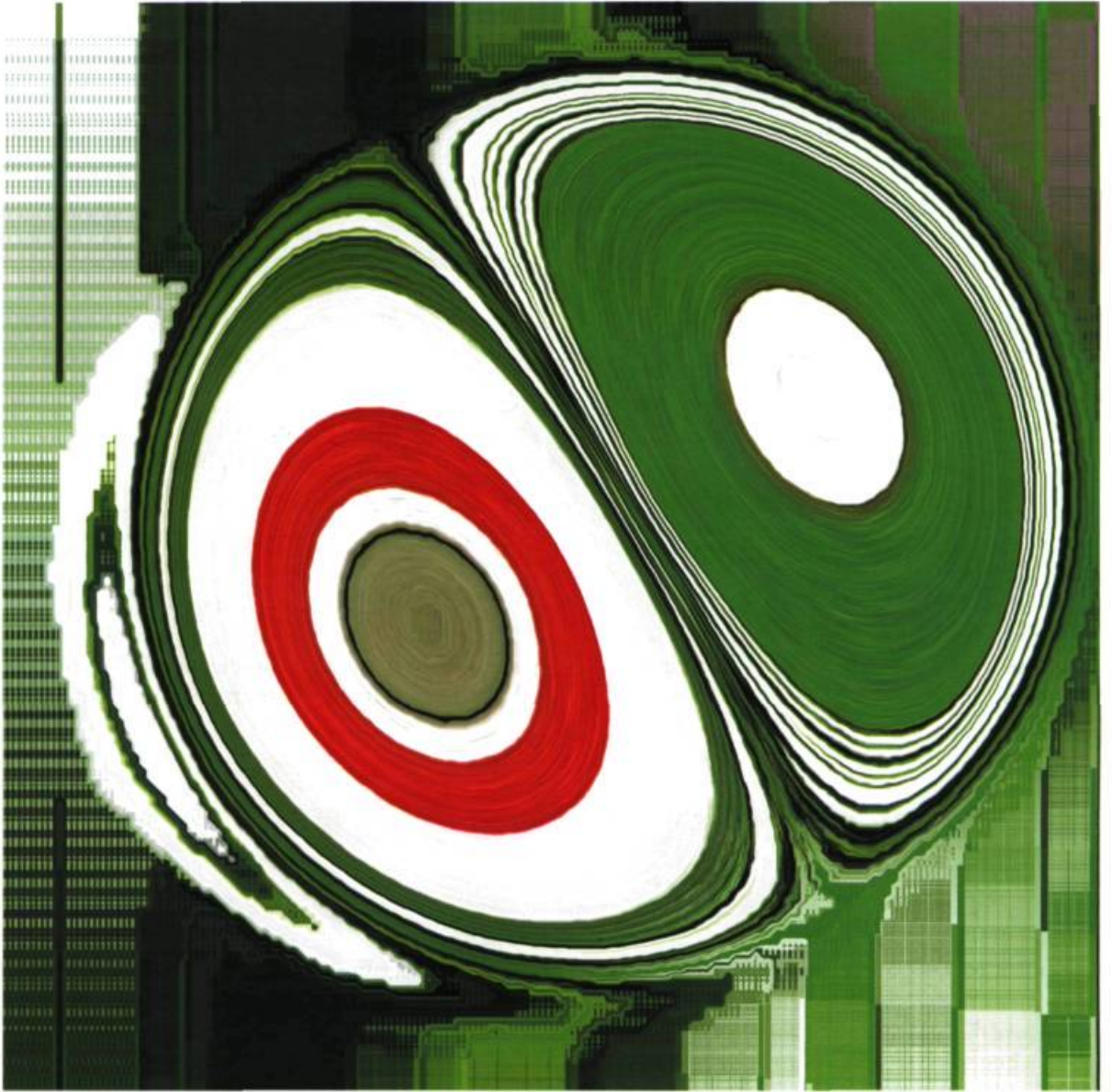
Paul Emile Rioux, Jell v9 (serie Jell'O), 2003.

Colour fields, or neo-geo-circuitry, or pure geometrics, can be alluded to, but they have been surpassed by the messenger, and the medium is the message, as the media theorist Marshall McLuhan once commented. The age-old technique of painting makes way for computer-generated imagery. We rediscover a life world because the medium is so fast, and our consciousness is challenge in the process. While spatial aspects are crystallized, frozen at a moment in time, they are nevertheless constructions enacted within a matrix with its own rules and limitations as exacting as the old-fashioned canvas was for painters. A lyrical aspect remains, still poetic, eviscerating space, rendering the image into something substantial. And artists such as Paul Emile Rioux are developing this new optic, one that emerges out of