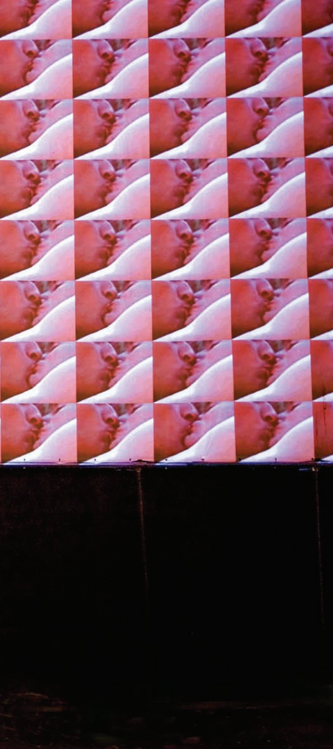
Rafael Lozano-Hemmer, Make Out , installation dans l'espace urbain dans le cadre de MUTEK_10, 2009.

system allowing the balloons to rise and descend (manipulated in real-time by Bauer), and a sound composition (performed live by Henke). The elegant interplay of waxing and waning lights, gently floating spheres and sweeping ambient music provided a glimpse into the micro world of atoms swirling together into molecular arrangements—a poetic transposition of elemental and infinitesimal rapprochements writ large for our perceptual delight. Atom proved to be a mesmerizing experience that also encapsulated the coming together of various artistic terrains (music, light, and kinetic sculpture) indicative of promising avenues for artistic hybridizations which make use of the digital and many creative forms and tools beside it.