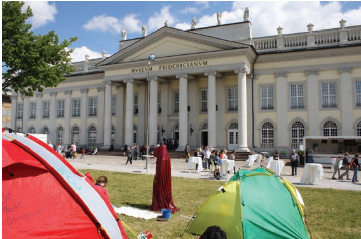
Occupy Documenta outside Friedrichsplatz, 2012.