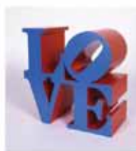
Robert Indiana Love , 1966