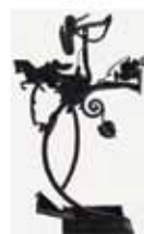
Jean Tinguely Cocktail au Choclat , 1966