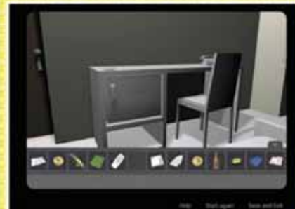
Studer / van den Berg