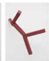
Joel Shapiro untitled , 2011