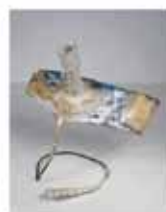
Franz West Pygmalion , c. 1980