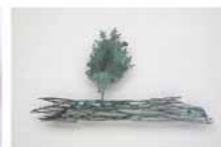
Kiki Smith Rabbit , 2004