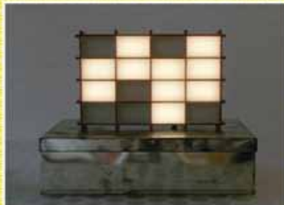
Atelier Hauert Reichmuth