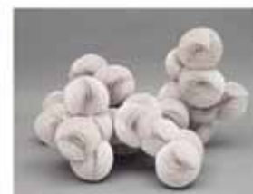
Tara Donovan Untitled (Paper Planes) , 2006