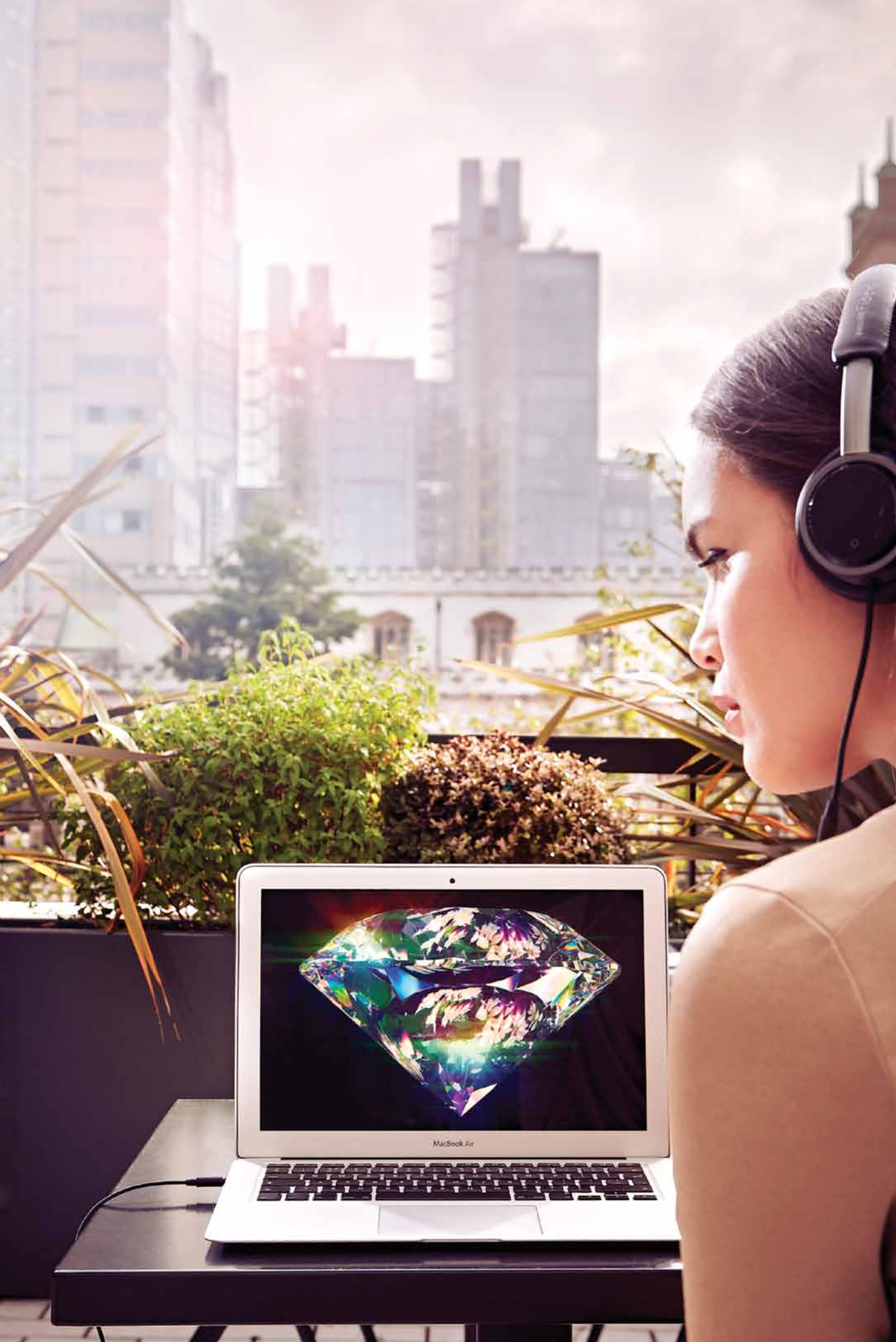
Mat Collishaw, Prosopopeia .