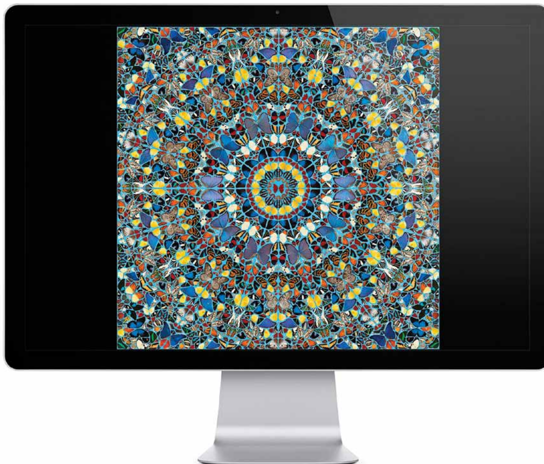
Damien Hirst, Idolatriy , displayed on iMac.

the new focus of his collection, and it is displayed on screens in the hotel rooms. But to do this, the hotel pays a yearly subscription fee.