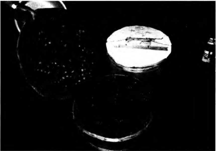
Photo 8. Snails being purged on a diet of polenta (corn meal), in Belli's cantina .