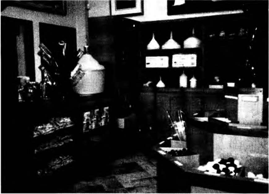
Photo 9. Home winemaking supplies at Magnotta Winery, Vaughan.

and perhaps supernatural (i.e. saints') intervention, but not chemicals. Some immigrants fear ready-pressed must (juice) for similar reasons, that is: one cannot know what additives it might contain. 20 Yet the school of hard knocks has forced many home winemakers to finally add sulphite to barrels, to bring their wine in for analysis, and finally, to buy ready-pressed juice from companies such as Festa Juice or Vin Bon, thereby avoiding the mess and guess work. The trend to purchasing juice ( mosto ) ready for vinification has made the wine press almost obsolete in Toronto, except for the diehards who refuse to give up old ways (Photo 9).