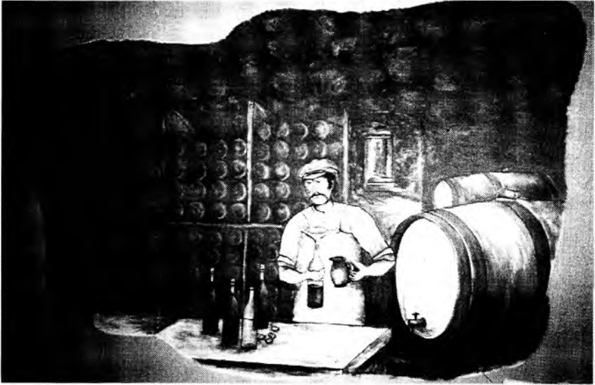
Photos 1, 2. Stylized hand-painted murals at Cilento Wines, Vaughan, “demonstrating the old world tradition of wine making”.