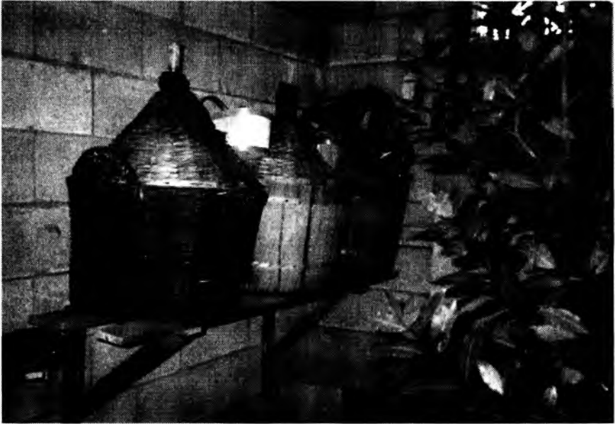
Photo 3. Traditional demijohns protected with basketry, and bushel baskets in Di Ninno cantina . Note the potted bay tree weathering the cold winter in the cantina .