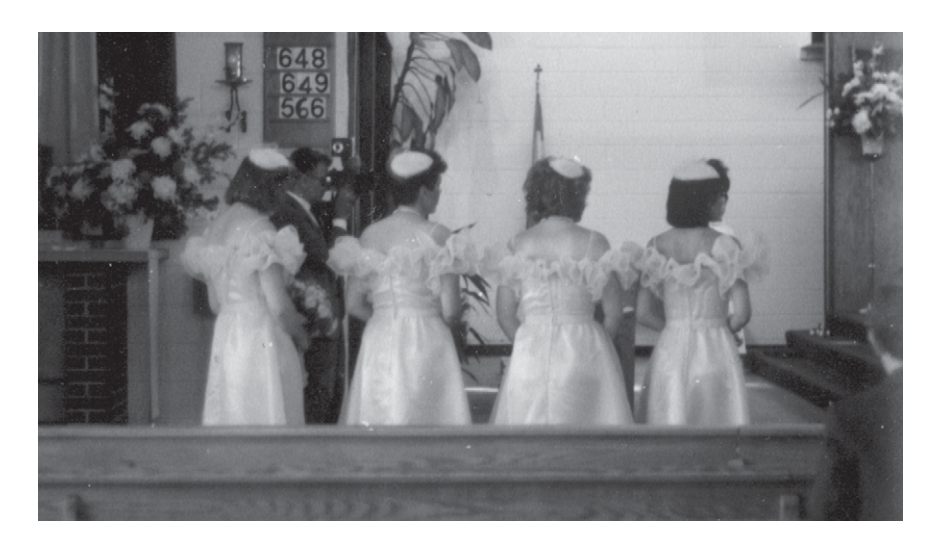
Figure 1. Detachable ruffles were put on these dresses to appease Church officials who did not want bare shoulders on the bridesmaids.

latent ideas of the bride as an individual as well as ideas about weddings in general. The white dress symbolizes purity and virginity. Although those factors are no longer integral to the worthiness of the bride as wife, when the woman chooses to wear a white dress, those held-over Victorian notions are apparent<sup>5</sup>. Moreover, the style of dress reflects the woman's personality, and her attitudes towards her body, sexuality, the wedding ritual, and marriage itself.