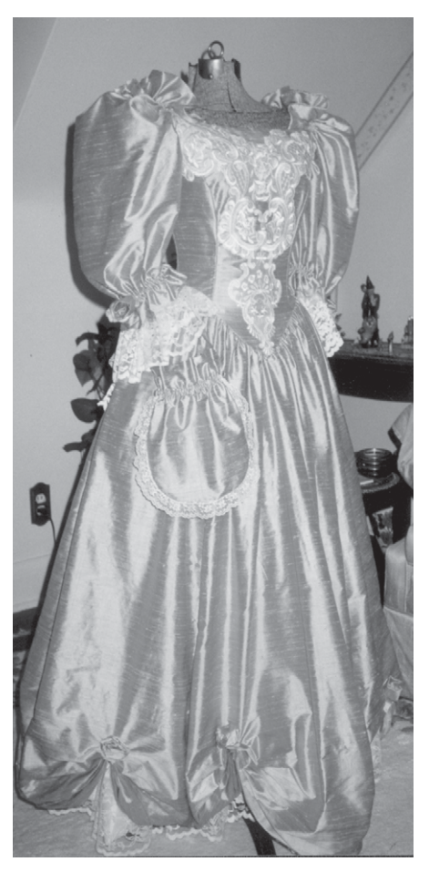
Figure 4. This dress fits conventional notions of the "typical" wedding dress with one notable exception: the colour is a deep golden peach. This was the bride's second marriage, so perhaps a white dress was not as significant as it was for her first wedding.

that permeate the dress itself. She makes it her own and it reflects her as the subject. However, once the bride dons the dress, she also takes on the role as object. Her very presence in the spectacle of the wedding illustrates this, as she (and the dress) becomes the focus of the gaze, the object to be criticized or admired. She becomes objectified in terms of her looks, and her marked-ness is evident for all to see. The dress becomes the primary means of examining her as object, and the two together become the centre attention in terms presentation of self. The dress, then, is a powerful means of communication. As Nancy stated, "the dress has to perform" (Figure 5). This curious duality leaves the bride in a precarious position, and might be part of the source for her agonizing over every detail. She wants to be perfect both as object and as performer/subject.