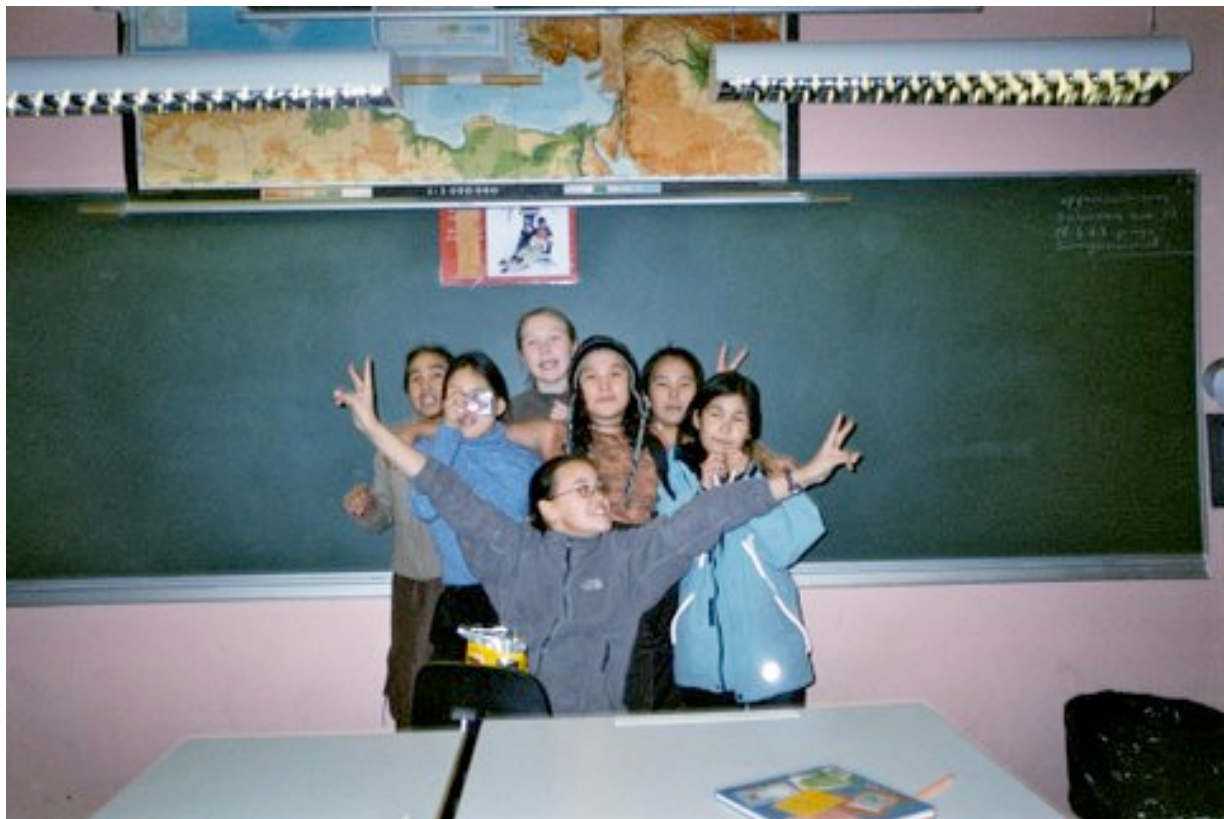
Figure 6. Example of photo without text: Joyous tweens anticipating the fun of playing around with a camera as co-researchers and symbolically occupying the global world. Photo by 12 years old girl, Nuuk (CAM II, 9:34).