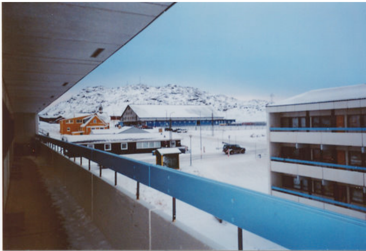
Figure 4. Examples of information loaded pictures with recognisable buildings or places: apartment blocks in Nuuk.