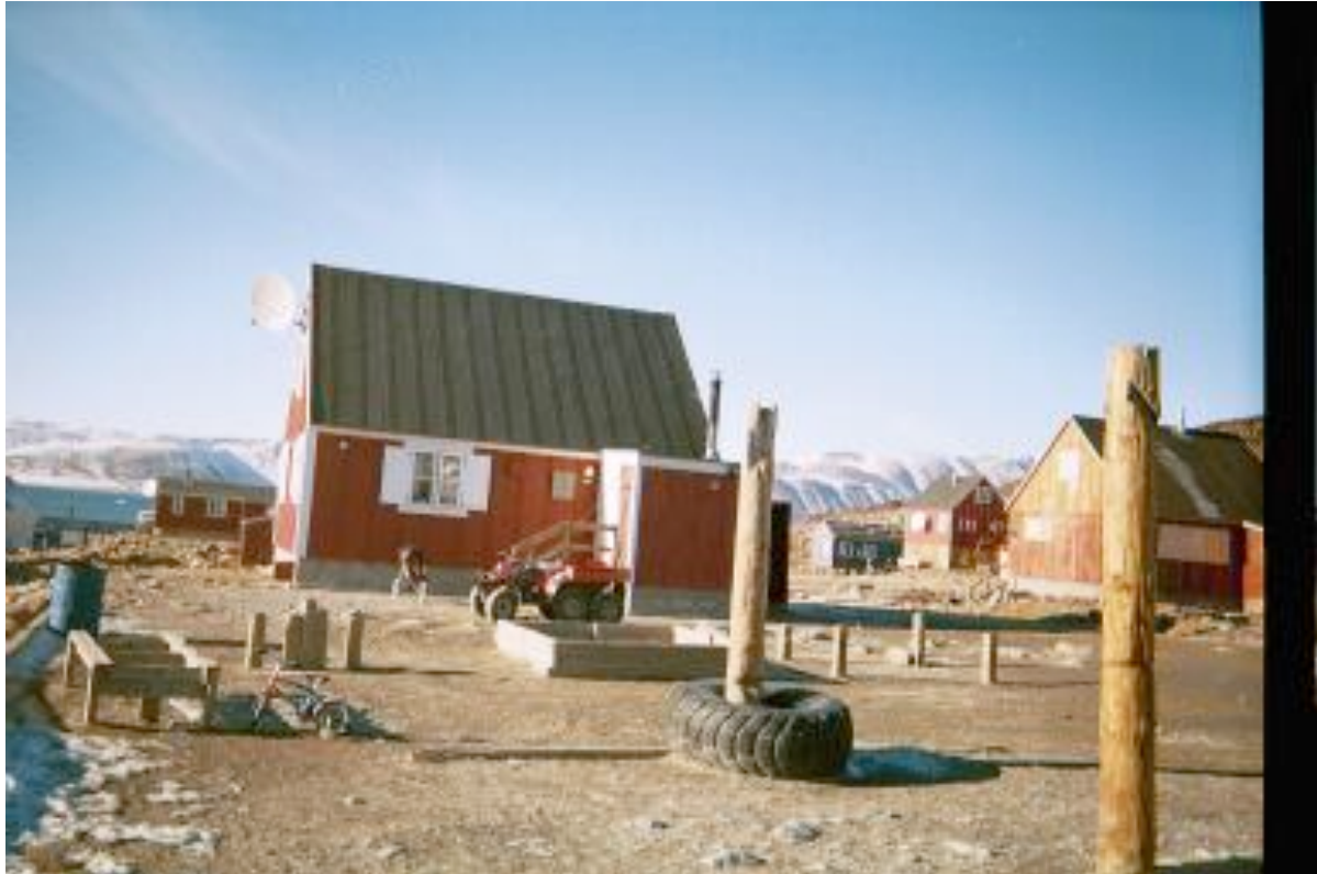
Figure 7. The police station. “You can be put in jail if you have killed someone, if you are a drug addict, or if you have stolen some money from a place of work [...]. And if you have tried to kill someone or have misused them [...] or if you have been too drunk. In that case they get handcuffed and are thrown into jail.” Photo by a 12 years old girl from Ittoqqortoormiit (CAM I, 78: 25).