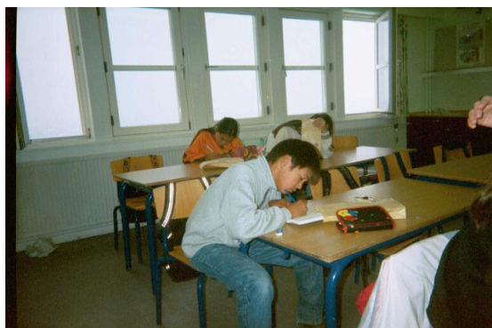
Figure 8. A comparison between photos from Nuuk and Ittoqqortoormiit concerning attitudes towards the camera. Top photo from Nuuk taken by a 13 years old girl (CAM II, 27: 25A), bottom photo from Ittoqqortoormiit taken by a 13 years old boy (CAM I, 83: 27).