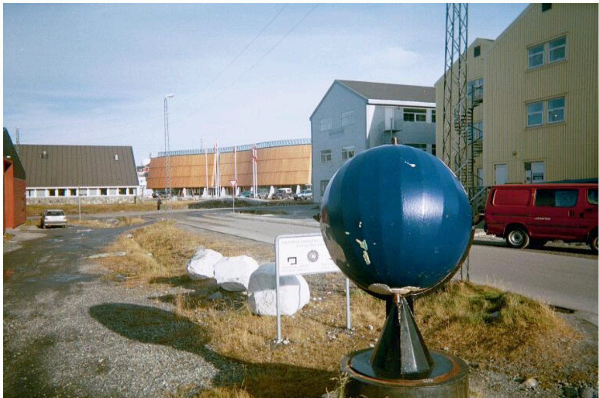
Figure 5. The globe of Nuuk’s vocational school with the cultural center Katuag in the background. Photo by 19 years old young man, Nuuk (CAM I, 35: 9).