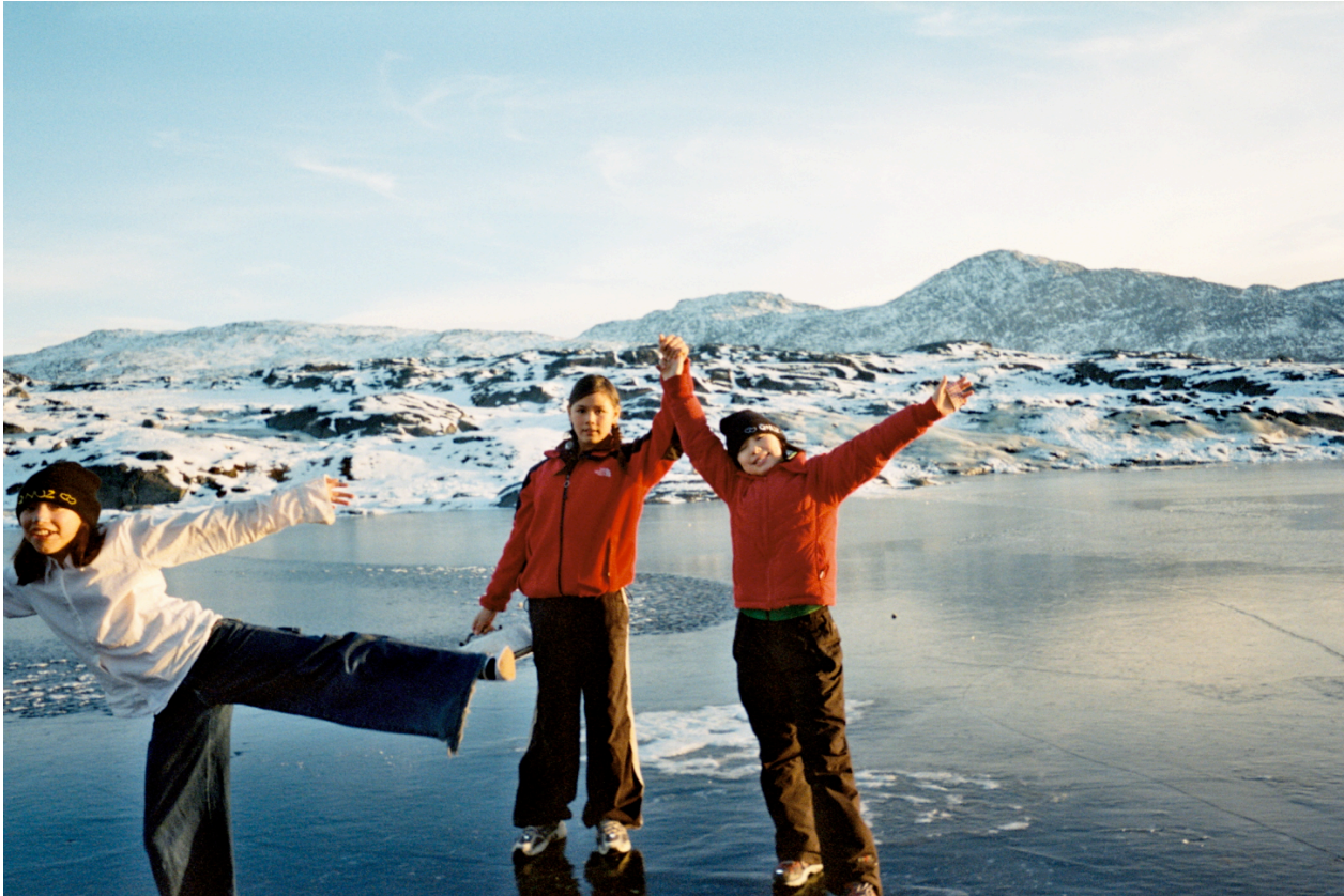
Figure 1. Example of a punctum picture celebrating play and friendship. Photo by a 13 years old girl from Nuuk (CAM II, 9: 24).