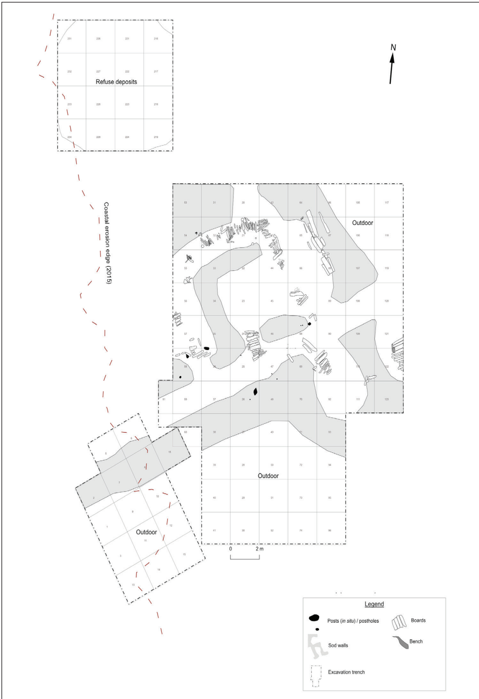
Figure 3. The Phase 3 house at the Nunalleq Site.