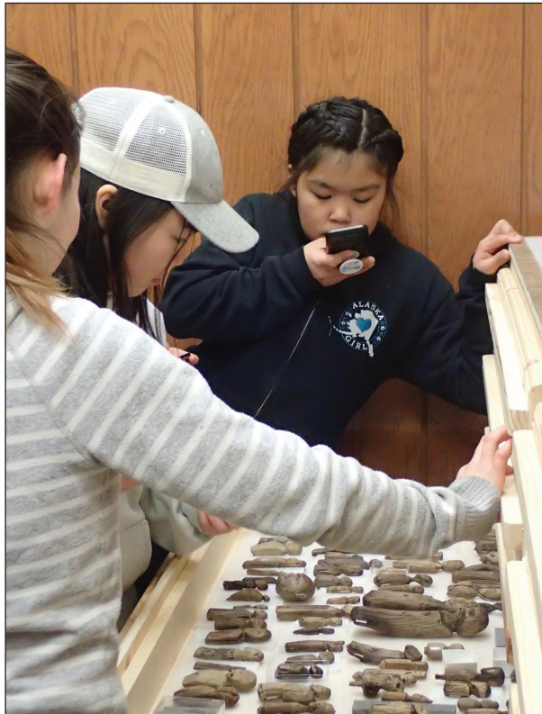
Figure 5. Quinhagak youth at the Nunalleq Culture and Archaeology Center, 2019.

skills, often incorporating objects in the collection, as in a Smithsonian Arctic Studies Center–sponsored grass basketry workshop (Crowell 2019). The center is also used for Yup’ik dancing and song, which has been reintroduced in Quinhagak after a hiatus of more than a century by the generation of young people that has grown up with the Nunalleq project. Further afield, a long essay describing the project, “In Quinhagak,” by well-known Scottish writer Kathleen Jamie (2020) was read on BBC Radio 4 to a British and international audience. The Nunalleq project has also figured into a wide range of media projects that have drawn public attention to the impact of climate change on archaeological sites in the North. Through this media attention the voices of the people of Quinhagak are now quite literally heard around the world.