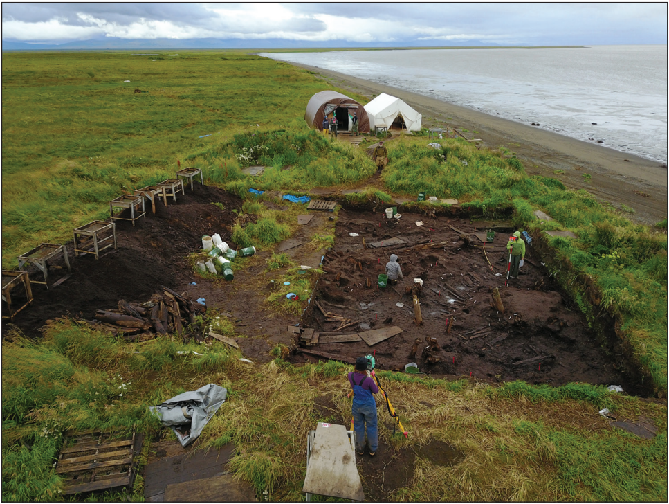
Figure 4. The Nunalleq Site in 2017, View South.

Mossolova et al., this volume). Many elements of ethnographically known Yup'ik belief systems are evident in the Nunalleq collection, such as transformation figures, half-face masks, and paired smiling and frowning faces. Wooden gaming pieces such as spinners, tops, gaming darts, and tally sticks recall ethnographic accounts of gaming (Nelson 1899; Fienup-Riordan 2007, 37). Toy bows and arrows, toy harpoons, and model kayaks as well as toy spoons, dolls, ulus, and bowls in the assemblage were used to socialize and train children for their adult roles. Taken as a whole, a great deal of the Nunalleq assemblage can be recognized in ethnographic collections made three hundred to four hundred years later, reflecting an innovative but generally conservative cultural tradition.