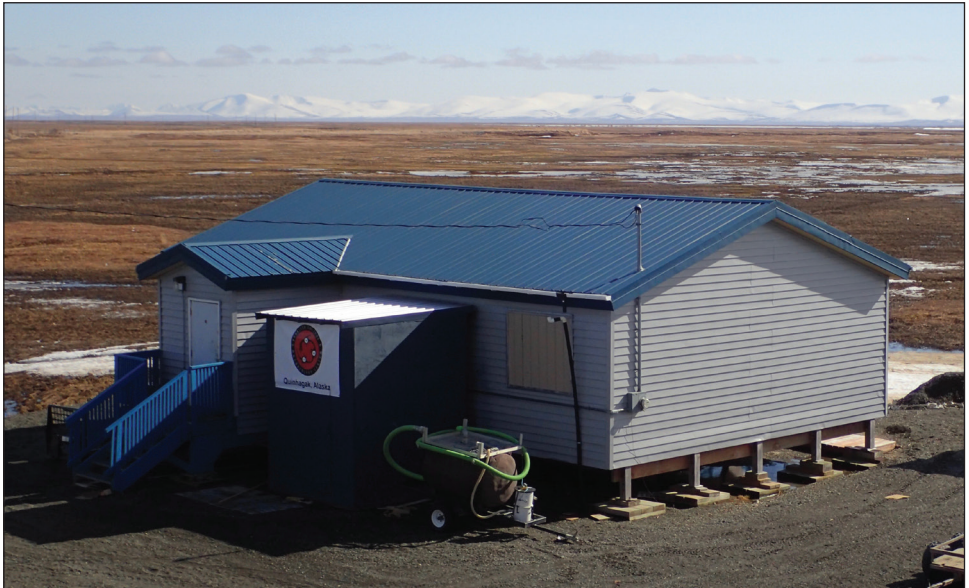
Figure 7. The Nunalleq Culture and Archaeology Center in Quinhagak, Alaska, 2019.