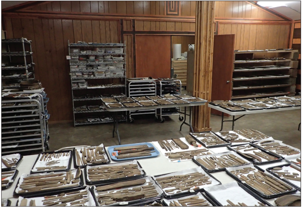
Figure 6. Wooden artifacts being conserved at the Nunalleq Culture and Archaeology Center.