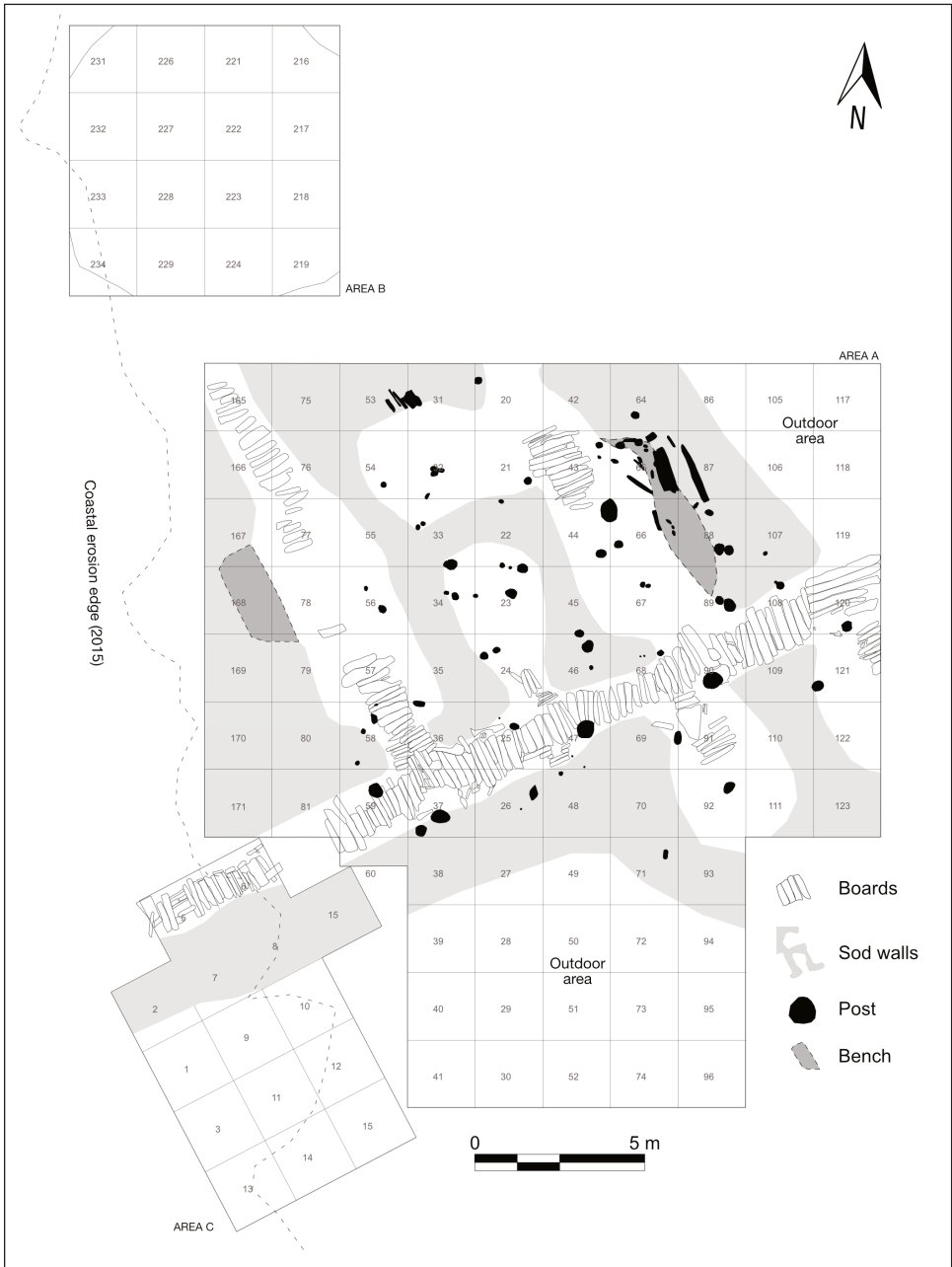
Figure 2. The Phase 2 House at the Nunalleq site.