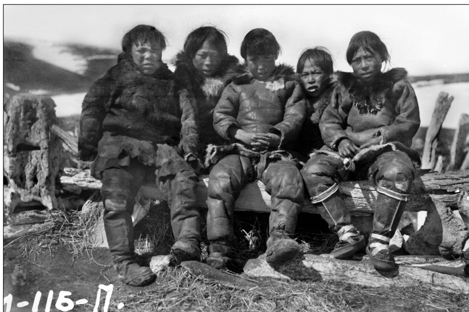
Figure 7. Yupik schoolboys in Sighenek (Sireniki). Photo: Aleksandr Forshtein, spring 1929 (?). MAE # И-115-17.