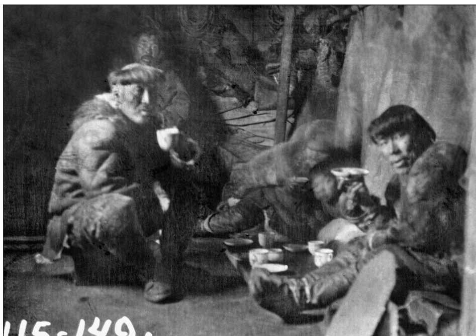
Figure 6. Drinking tea inside a Yupik house in Avan. Photo: Aleksandr Forshtein, spring 1929 (?). MAE # И-115-149.