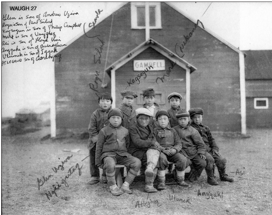
Figure 2. Gambell schoolboys, with their names and comments inscribed by Elders on paper prints. Photo: Leuman M. Waugh, 1929. NMAI, N 42796 (uncaptioned negative).

personalities, people’s lifestyle, and local scenes depicted by a caring, though uninformed, medical doctor.