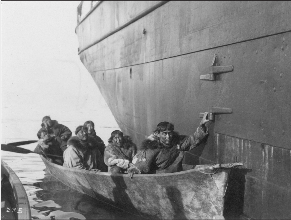
Figure 5. Yupik men and women approach the George W. Elder ship of the Harriman Expedition in Plover Bay in July 1899.