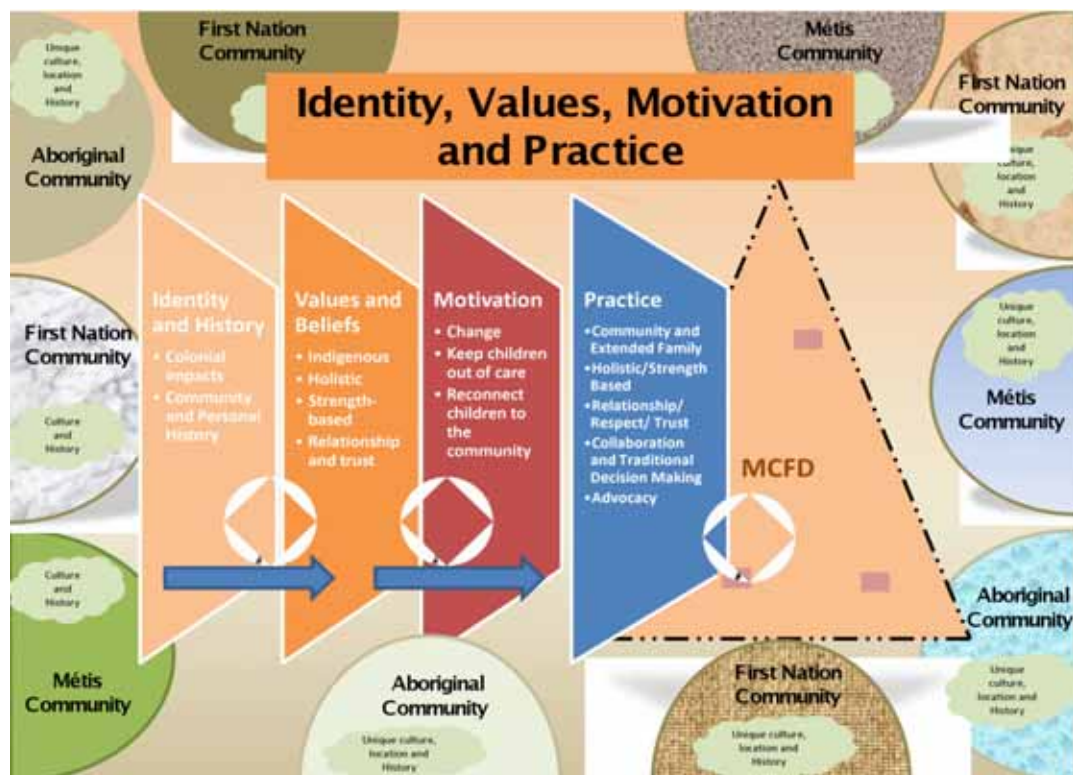
Figure 1: The identity, values, motivation and practice of Aboriginal professionals

The visual map below illustrates prevailing themes that emerged in the study regarding how MCFD Aboriginal professionals’ described their identity, values, motivations and practice approaches.