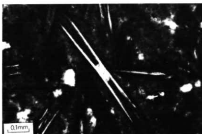
Figure 2 Quench calcic plagioclase in tholeiitic metabasalt.

The research project has two major directions in which the funding has been applied. Firstly a considerable amount has and is being used for support of graduate students (14