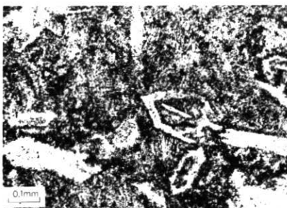
Figure 3 Quench olivine replaced by quartz in high-Mg metabasalt.