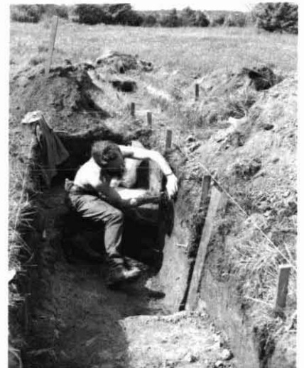
Figure 1 Soil sampling at an archeological site

The preservation of the remains of physical structure in the ground such as post holes, pits, and hearths, together with the artifactual material within soils, undoubtedly facilitates archeological interpretation, but perhaps even more important is the fact that the soils presently covering archeological sites also contain a chemical record of past human activities.