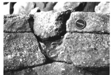
Figure 2 Side view