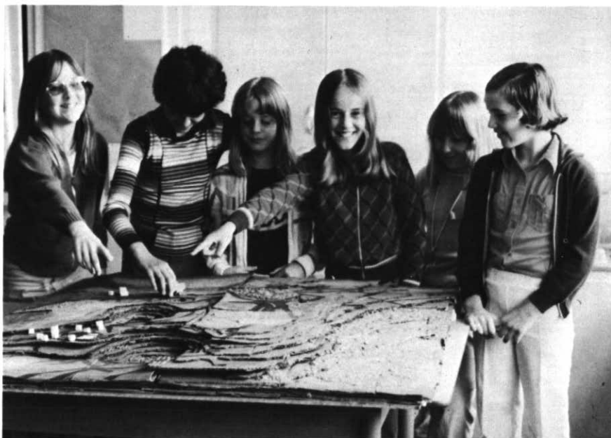
Figure 1 Grade 7 students in B.C. built a model of an open pit mining operation to familiarize themselves with the people and processes in mining. The students and teachers in B.C. and Ontario are involved in the

Completing ongoing programs in two Provinces as well as starting the Project in others, remains a question of available funds. Besides mining companies, the fundraisers are approaching the support industry, suppliers, unions, banks, accounting firms, professional services and individuals for contributions. Associated groups such as the Mining Women's Association of Greater Vancouver are assisting the project with materials and other services.