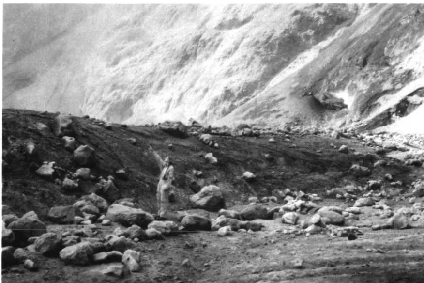
(b) (lower) Toe of large thrust fault (Outward Bound thrust; Chadwick and Swanson, 1989) formed in 1982 on crater floor. Observer points toward dome. This fault enlarged from a wrinkle similar to that in Figure 2a in about 1 week. Large blocks were emplaced by rockfalls from dome and by relatively large explosions.