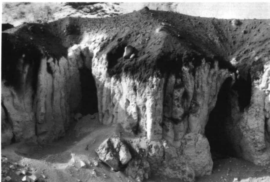
Figure 1 Vertically columnar dacite lobe exposed in wall of crater formed by sector collapse in February 1983 and enlarged by explosions throughout 1983. The explosions deposited 5 m of tephra (dark) above lobe.