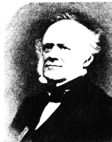
Figure 2 Sir Charles Lyell, 1797-1875.