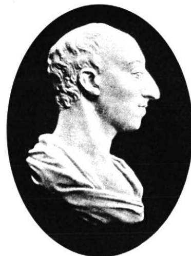
Figure 1 James Hutton, 1726-1797.