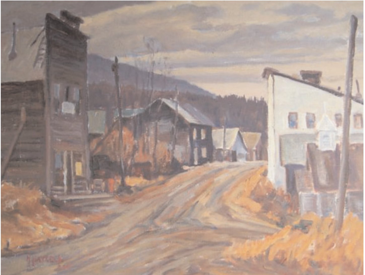
Figure 2. Keno City, Yukon, painted in September 1964 by Dr. Maurice H. Haycock. The village, which is still occupied, sprang up as a typical boom-town at the foot of Keno Hill during a staking rush in 1919.

western NU, Quebec and eastern NU; and Atlantic Canada. If anyone would like to become involved or have constructive suggestions, they can reach me at bobcat62@telus.net. The biggest challenge is always to find the authors, particularly geologists who also feel comfortable researching and summarizing history.