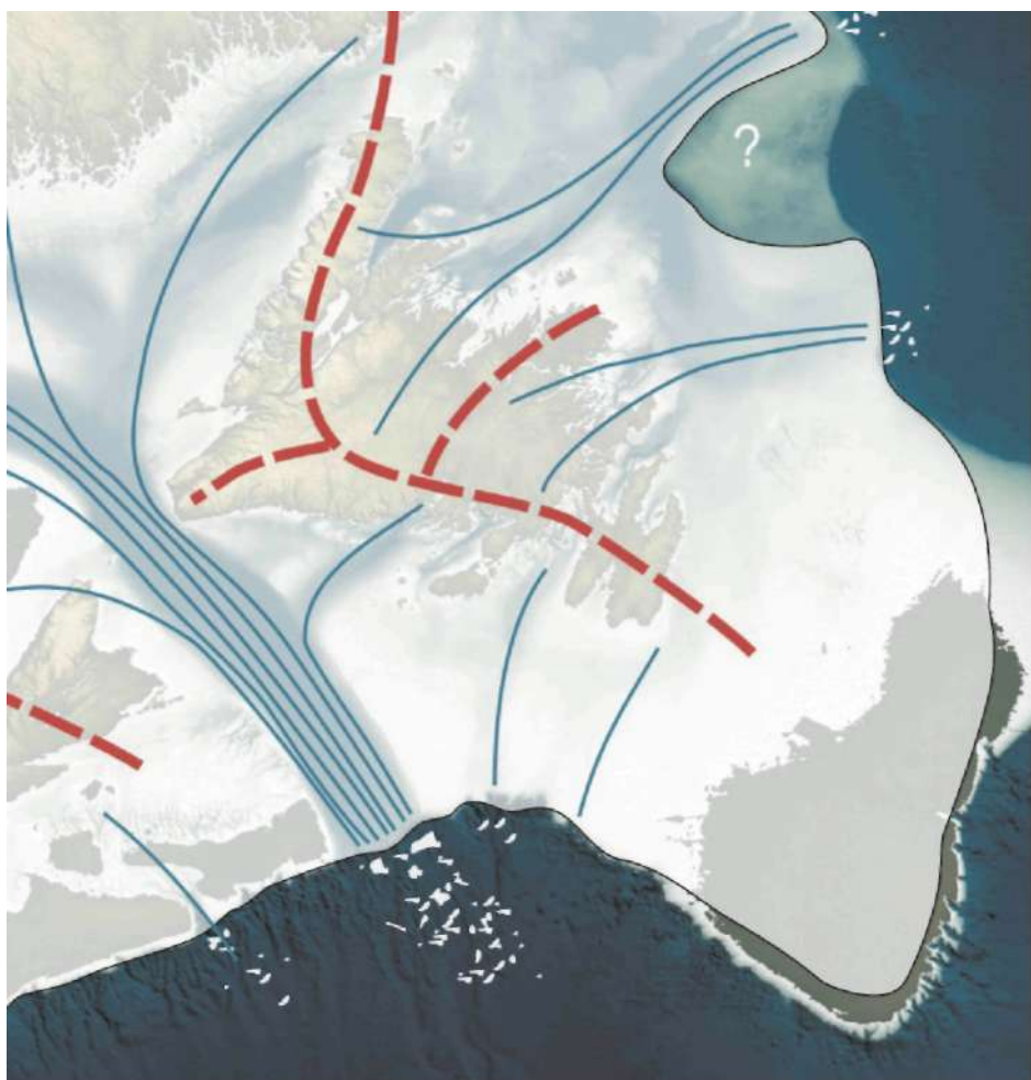
Figure 1. Conceptual model of the ice cover over Newfoundland during the last glacial maximum (modified from Shaw et al. 2006). Red dashed line indicates ice divide or ridge, thin blue lines represent generalized ice-flow trajectories.

sensitive to the number of measurements made.