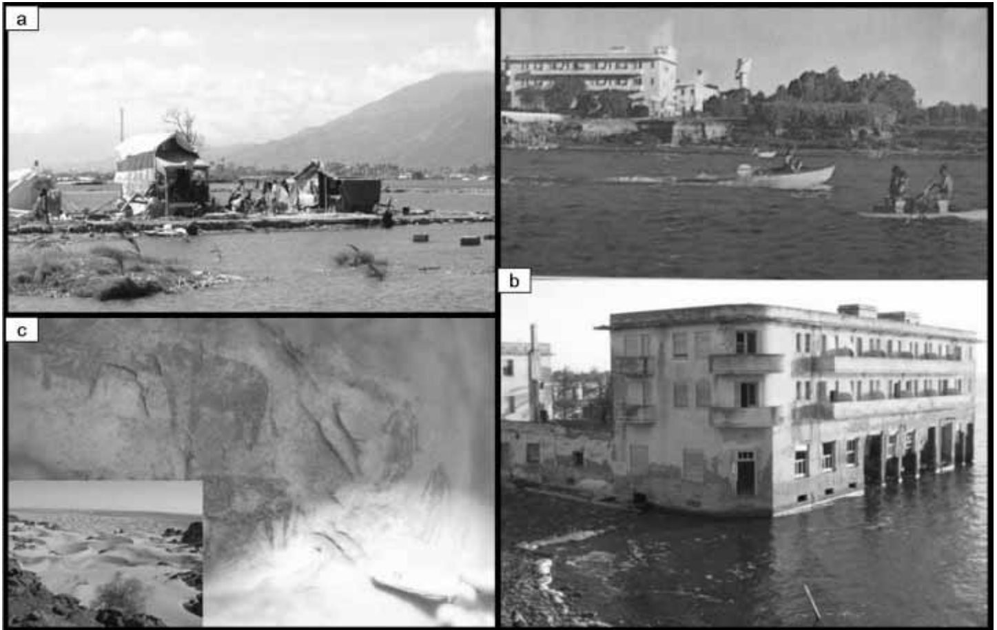
Figure 2. a) This family near Banda Aceh in Sumatra is trying to rebuild their home where it was before the land subsided during the earthquake; b) Laguna Mar Chiquita, in Cordoba Province, Argentina, one of the largest saline lakes in the Southern Hemisphere, has varied markedly in level, mainly as a result of changes in rainfall. Today, this once proud lakeside hotel is abandoned, save for the occasional “mystery tour”; c) Dune field in western Mauritania (inset). Caves in foreground contain Neolithic rock paintings of people and animals.

Aegean Sea between 1628 and 1520 BC was responsible for the demise of the Minoan culture of Crete shortly afterwards. Current research, however, indicates that there were likely other social and economic factors involved, and that the huge eruption and collapse of Thera may have had only a marginal effect (Grattan 2006).