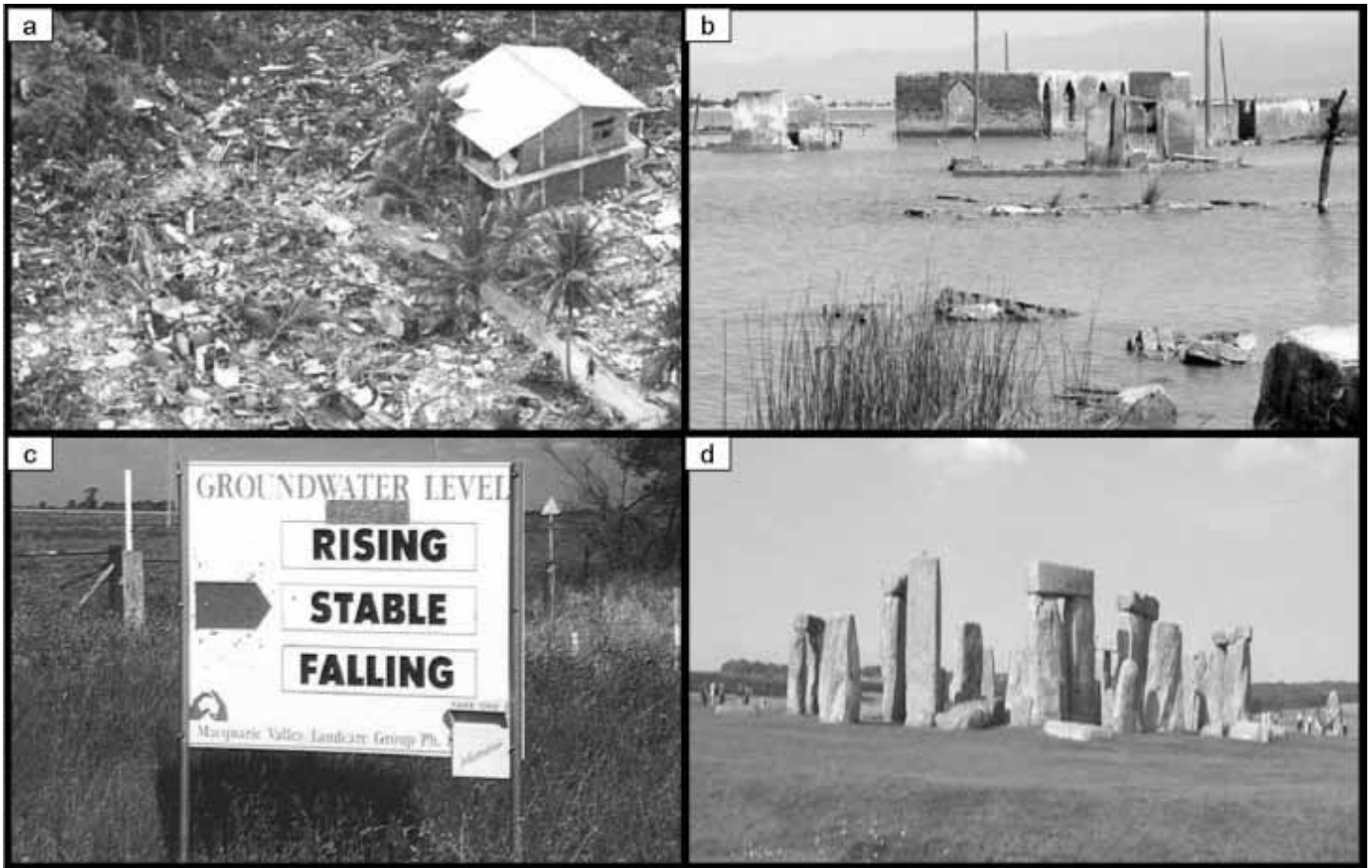
Figure 1. a) The tsunami of December 26, 2004 destroyed this urban landscape in Galle, Sri Lanka; b) Iranian mosque flooded by sea-level rise. Eastern end of Minakaleh spit, SE corner of Caspian Sea; c) To assist farmers in managing groundwater usage, a sign near Narromine, NSW, Australia, indicates changes in groundwater level; d) Stonehenge in southern England - little change over some 5000 years.

1977, and by 1992 it was 2 m higher. The scale of this change was comparable to the disastrous fall of the 1930s, although in the opposite direction. The shoreline of the sea in places moved 25-35 km inland, and ports, railroads, roads, oil wells, and even a nuclear waste dump were inundated (see Fig. 1b). These variations in sea levels forced many changes to coastal landscapes, habitats, vegetation and aquatic life. They also caused great difficulties for people living on the edges of the sea. In the latest flooding, some 25 000 people lost their homes. The financial costs, during the period of rising water levels, for Kazakhstan reached $2 billion, Azerbaijan nearly $4 billion and Russia $7 billion (Golubev 1998). The best attempts to plan ahead had been thwarted by nature's surprise.