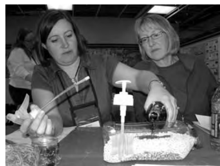
Figure 2. Teachers working on the groundwater system activity.