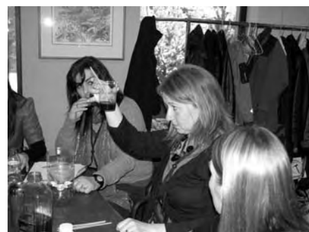
Figure 3. Teachers working on the water filtration activity.