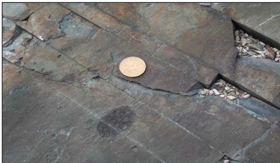
Hiemalora, Murphy's Cove, NL.

geological history has shaped the land, and the land has shaped the people and culture.