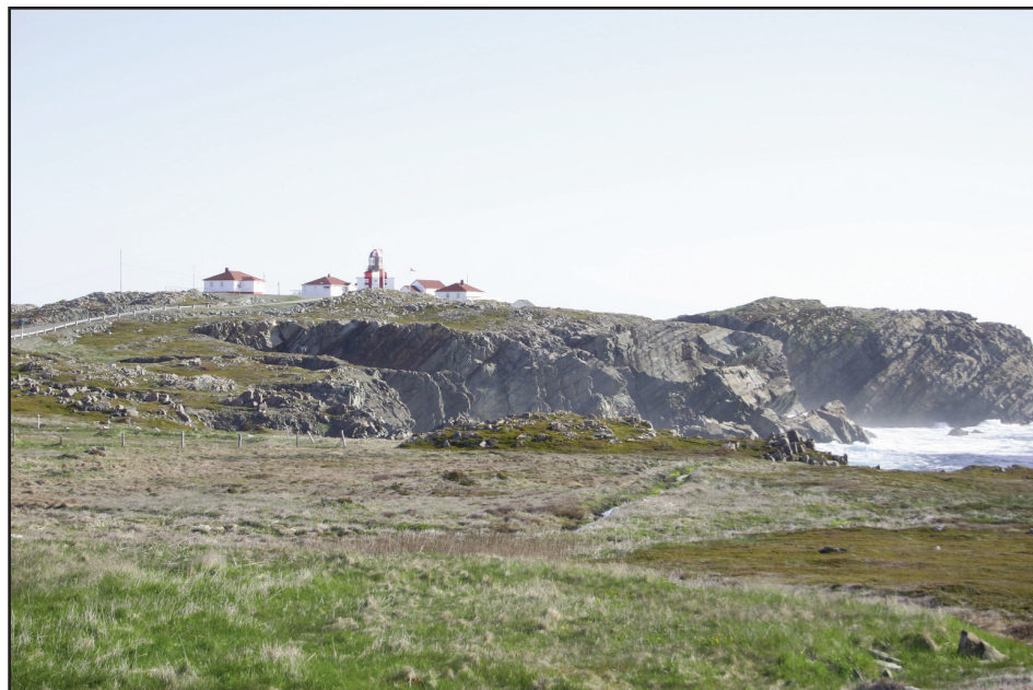
Cape Bonavista Lighthouse and the underlying cliffs, NL.

The Discovery Trail stretches along the Bonavista Peninsula in eastern Newfoundland and spans one of the most historic and beautiful parts of the province. This three-day field excursion will explore the coastal geological heritage of the region, and how its