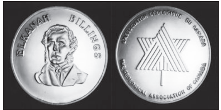
Figure 4. Elkanah Billings Medal awarded by the Geological Association of Canada Paleontology Division since 1978. Undated.