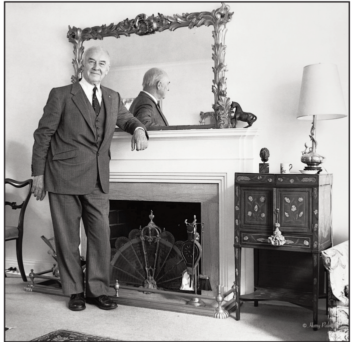
Figure 1. There are many 'official' pictures of Tuzo Wilson, but it seems more appropriate to use this lovely photograph by renowned Canadian photographer Harry Palmer, and we reprint it with his kind permission. Harry took splendid and candid photographs of many 'Companions of the Order of Canada,' and Tuzo was awarded this honour in 1969, three years after his famous paper.

came between 1962 and 1965 in his papers on the Cabot Fault (1962), and interpretations of oceanic islands (1963a) and Hawaii (1963b) as hot-spot tracks, culminating in his definitive 1965 paper that founded plate tectonics and his clever paper (1966) on the Caribbean and Scotia plates moving through gaps between continents and invading 'innocent' oceans with rifted margins. Strangely, Tuzo did not use rotation poles to describe relative motion among his global plate mosaic, in spite of the implicit rigidity of plates, even though used, explicitly, by Wellman, Quennell, and Bullard et al. Within a few years, plate tectonics was developed as a quantitative, integrated theory by McKenzie and Parker (1967), Morgan (1968), Le Pichon (1968), and Isacks et al. (1968).