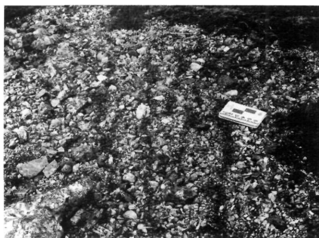
FIGURE 3. Active, small sorted stripes near Harbour Breton developed on a 3° slope. Darker bands are finer material.

Petits cercles avec triage en formation près de Harbour Breton. Le marteau (35 cm de longueur) repose sur une des roches stationnaires couvertes de lichen. Ces roches encerclent le matériel trié de couleur plus claire.