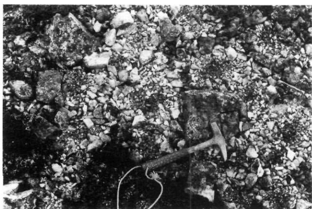
FIGURE 2. Active, small, sorted circles near Harbour Breton. The hammer (35 cm long) rests on one of the inactive, lichen covered, larger clasts, which border the sorted lighter coloured material.

Inspection of meteorological data for Grand Bank (Table I) on the Burin Peninsula, 45 km from Harbour Breton, and daily temperature records from Seal Cove for 1978 (Fig. 4), provides an indication of why the active, small-scale patterned ground exists at low elevations at this latitude. Mean daily temperatures fluctuate on either side of the freezing point throughout the