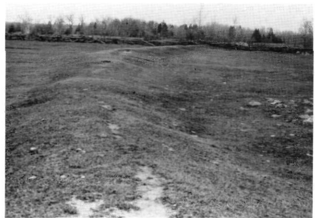
FIGURE 7. Pop-up near Turtle Lake.

Photo aérienne d'une structure de soulèvement (flèche), près du Ice Lake.