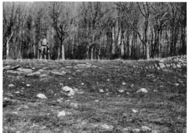
FIGURE 9. Ice Lake pop-up. Person standing on crest with photo taken from eye height of 183 cm to show height of pop-up and tilted rock slabs on south flank.

Structure de soulèvement, près de Turtle Lake.