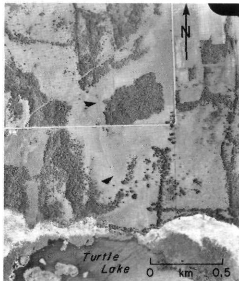
FIGURE 6. Air photo of pop-up (arrow) near Turtle Lake (Ontario Ministry of Natural Resources 73-4535,9-59).

Photo aérienne d'une structure de soulèvement (flèche), près de Turtle Lake (Ministère des Ressources naturelles de l'Ontario, 73-4535,9-59).