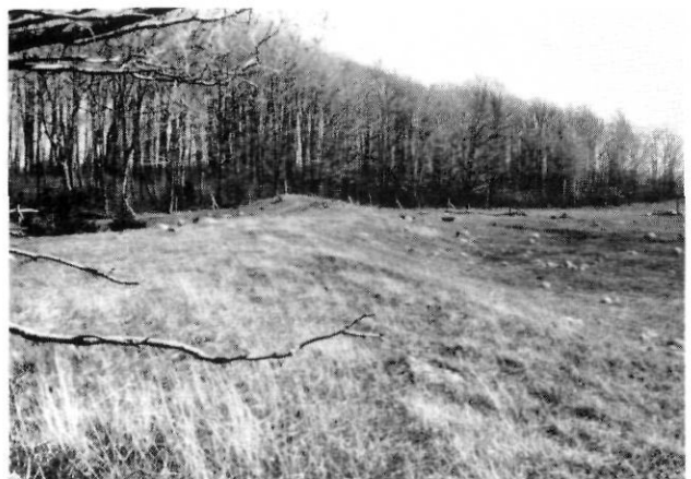
FIGURE 10. Ice Lake pop-up showing kinks in crest.

Structure de soulèvement, à l'est du Ice Lake. Le personnage sur la crête a été photographié à hauteur d'yeux, à 183 cm, afin de montrer la hauteur du soulèvement et les dalles de roche basculées sur le flanc sud.