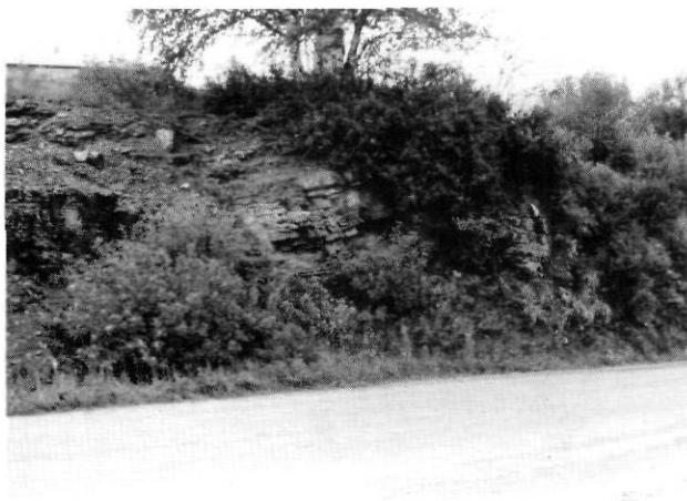
FIGURE 2. Faulted limestone on the Lindsay Formation, south side of Sim Street, Little Current.

Île Manitoulin et localisation des éléments décrits dans le texte.