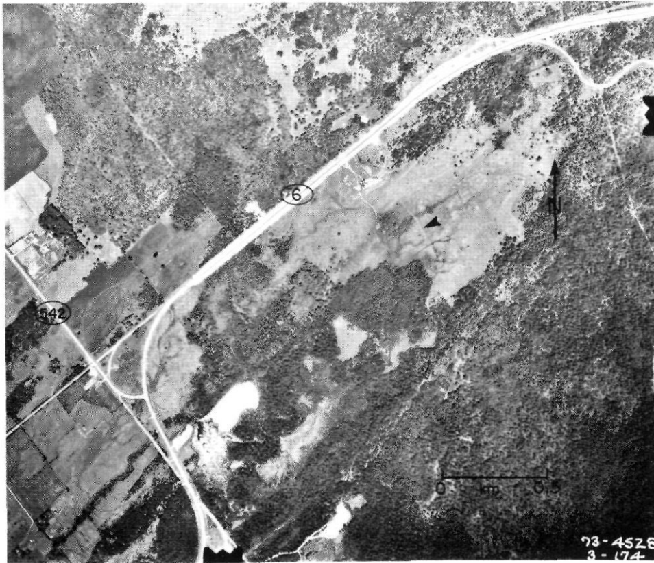
FIGURE 4. Air photo showing pop-up (arrow) southeast of Highway 6 (Ontario Ministry of Natural Resources 73-4528, 3-174).

Photo aérienne montrant une structure de soulèvement (flèche), au sud-est de la route 6 (Ministère des Ressources naturelles de l'Ontario, 73-4528, 3-174).