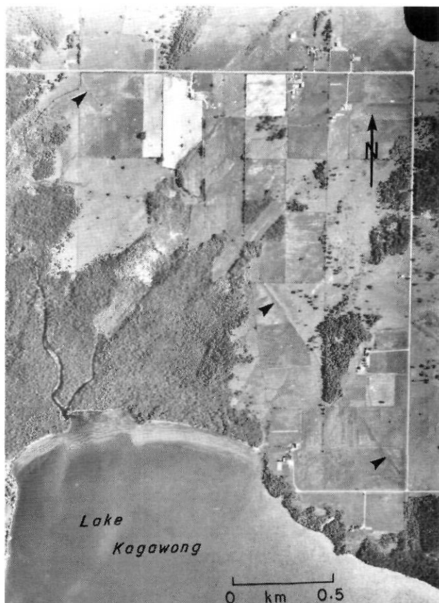
FIGURE 8. Air photo of pop-up (arrow) near Ice Lake (Ontario Ministry of Natural Resources 73-4536,8-155).

Photo aérienne d'une structure de soulèvement (flèche), près de Turtle Lake (Ministère des Ressources naturelles de l'Ontario, 73-4535,9-59).