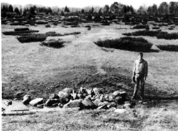
FIGURE 5. Pop-up southeast of Highway 6 showing heaved limestone in anticlinal structure.

Photo aérienne montrant une structure de soulèvement (flèche), au sud-est de la route 6 (Ministère des Ressources naturelles de l'Ontario, 73-4528, 3-174).