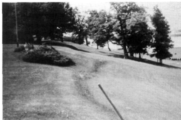
FIGURE 2. Trace of the continuous scarp, visible as a dark strip of grass. Located 1 km north of Mooretown.

The southern limit of recognized subsidence is located 500 m south of Mooretown (Fig. 1) where a commercial gravel dock, constructed of sheet piling driven into the river bed and extending 25 m into the St. Clair River, partly col-