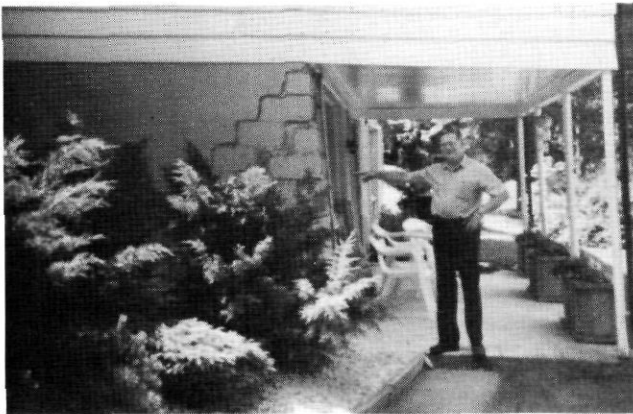
FIGURE 3. A structurally damaged home with a fractured concrete foundation and a downwarped overhang. Note that the supporting columns and the walls are no longer vertical. This house was replaced with a new one upslope, and away from the area of ground movement.

Structures d'une maison endommagées avec fracture dans les fondations de béton et affaissement. Noter que les poutres de soutien et les murs ne sont plus verticaux. Une nouvelle maison située plus haut, loin des mouvements de terrain, remplace la maison endommagée.