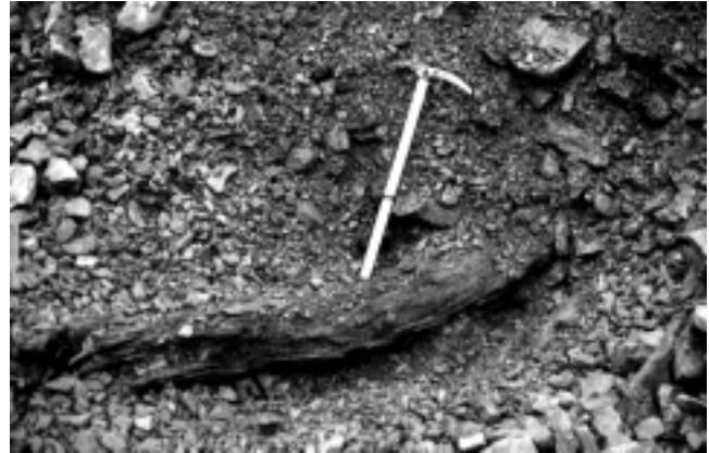
FIGURE 5. Shown is one of the larger boles (97HG1) exhumed from beneath the frozen rock glacier debris. The trunk rests on the buried forest floor and was killed sometime after the 1856 growth year.

Preliminary excavations within the distal apron of the rock glacier, at a point ca. 50 m southwest of Hilda Creek, led to the discovery of two boles solidly frozen to the pedogenic surface below debris spilled from the rock glacier snout (Fig. 5). Further digging revealed the remains of a total of six