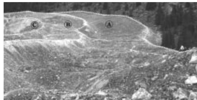
FIGURE 3. View to the northwest looking across the broad, flat surface of Hilda Creek rock glacier (A). A prominent thaw pit is shown in the left foreground. Pictured in the background are the Little Ice Age end moraines deposited by Hilda Glacier in ca. 1805 (B) and 1911 (C) AD. Note the stand of Picea engelmannii , located adjacent to the rock glacier snout, which was used to develop the living tree-ring chronology.

The research activity reported here focuses on the sedimentary apron of this outer ridge, close to where Hilda Creek emerges from beneath the debris (Fig. 2). The steep (>30 %) sharp-crested character of the frontal margin (Fig. 4), evi-