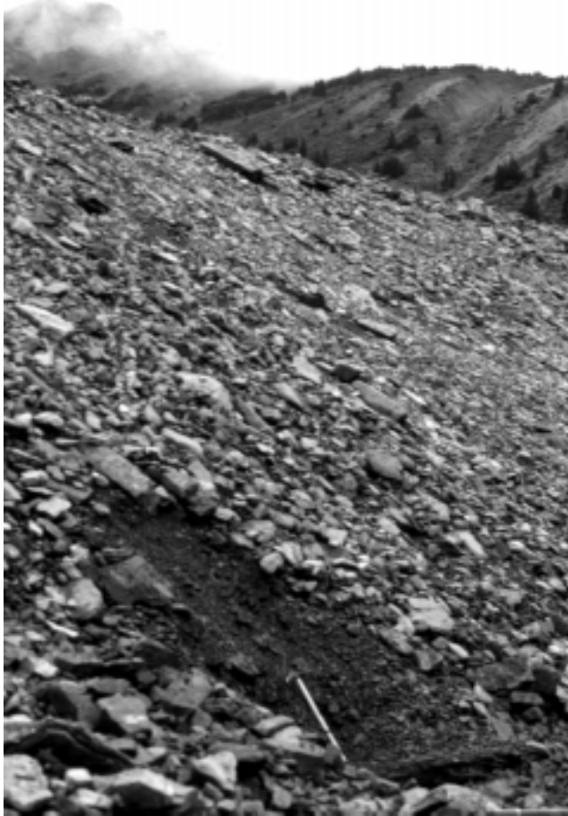
FIGURE 4. Steep frontal margin of the outermost debris complex in the Hilda Glacier forefield. The ice axe sits within our excavation and points downwards to one of the boles recovered from beneath the debris.

Marge frontale escarpée du complexe de débris le plus externe au front du glacier de Hilda. La hache repose dans un des trous creusés dans le cadre de la présente étude et pointe vers un des troncs recouverts de sous les débris.