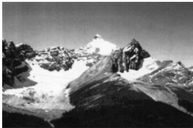
FIGURE 1. View west toward Hilda Glacier on the left and Mount Athabasca in the background, July 1981. The study site is located immediately to the left of where Hilda Creek emerges from beneath the distal sediment apron and traverses the local treeline in the left foreground. Shown in the right foreground is the "Hilda Rock Glacier" examined by Bajewsky (1988).

In a recent review Luckman (1998) illustrated the application of dendroglaciology to Little Ice Age glacier studies in the Canadian Rockies. We intend to show that dendroglaciological techniques may be equally suitable for describing the activity of selected rock glaciers over the same interval.