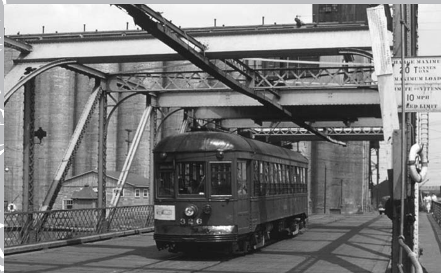
Crossing Black's Bridge over the Lachine Canal in June 1955.

Today, equipment from the M&SC, some has been fortunately preserved at Exporail, St. Constant/Delson, Quebec (104 & 611); Halton County Radial Railway Museum, Milton, Ontario (107); Shoreline Trolley Museum, East Haven, Connecticut (9) and Seashore Trolley Museum, Kennebunk, Maine (504, 610 & 621).