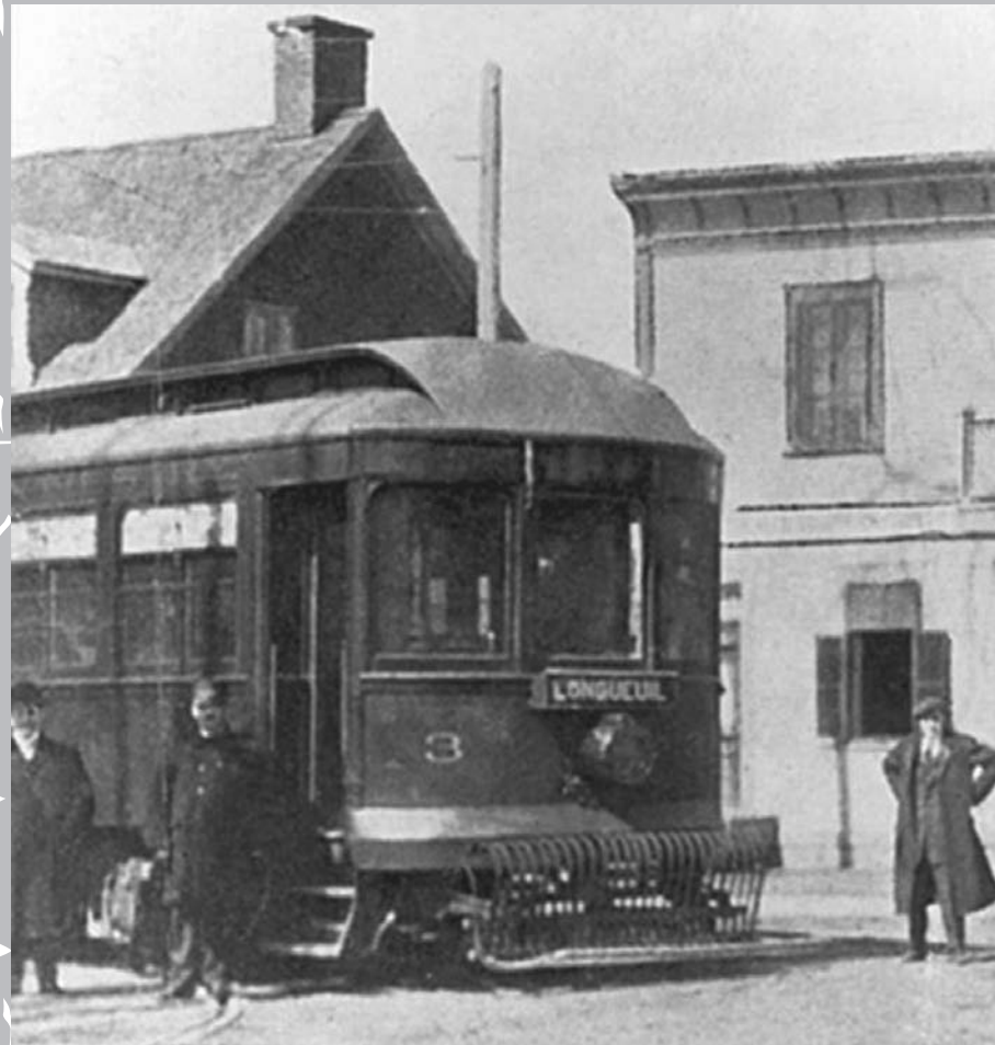
Corner of rue Guillaume and chemin Chambly.

With the acquisition of three new diesel locomotives in late 1951, electric service to Granby ceased on Saturday, November 24, 1951 and was replaced by diesel service the following