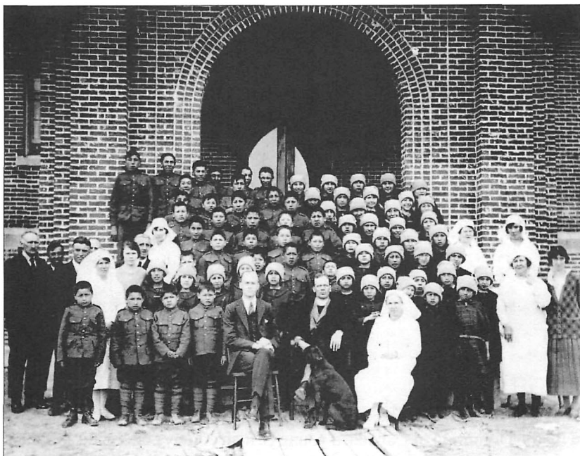
Figure 3. Pupils and staff, St. Paul's School, Blood Reserve, 1924.

sustained them and gave them identity as Niitsitapiiksi . Throughout all of this, consciousness of Blackfoot territory became colonized: the “rez” became the homeland, while Náápiikoaiksi occupied all of the remaining kitáóowahsinnoon .