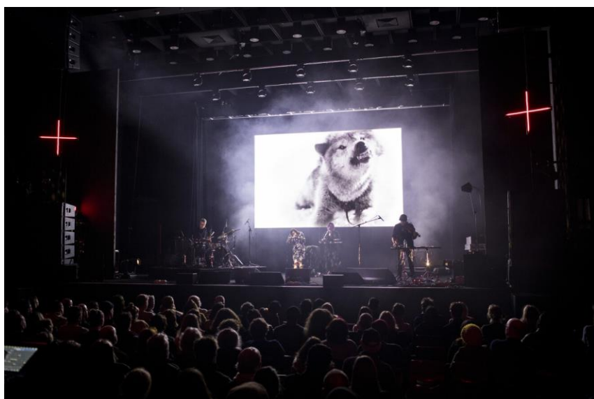
Fig. 4. Tanya Tagaq, Nanook of the North at the Dark Mofo Festival, June 8, 2018.

imagination of sound that moves across breath: the dog's howl, the howling wind, and Nanook's stillness. But Tagaq's vocalizations, rhythmic and guttural, soft and babbling, held off and held back a mimetic rendering of the sound, stretching the space between film and performance, failing to sync up. Power rippled down the outstretched antenna of Tagaq's arm, pulling in the film's affect and building suspense. When she finally arced back her head and released a howling cry, it did not simply sync up with the animal, human, or environment onscreen in mimetic empathy; indeed, there was a miss between image and sound. Instead, the dynamic form animated the anarchival impulse of the work's chronic collage.