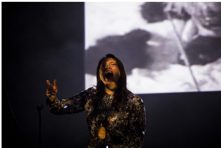
Fig. 5. Tanya Tagaq, Nanook of the North at the Dark Mofo Festival, June 8, 2018.

Porosity thus becomes a site of potential, exposure, and entanglement all at once, questioning the stability of our worlds, human and nonhuman. In a porous relationality—attuning to how others (cannot) breathe, our haptics are enhanced and we develop capacities to feel one another otherwise. 33