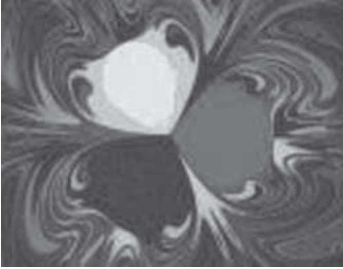
Fig. 2. Fractal basin boudary.

et résumerait en lui ceux qui le précèdent.” (IM, p. 208-209) Bergson’s simile is particularly, almost poetically effective because it not only expresses the smooth or continuous spatial motion of duration as it passes through qualitatively different “states,” but also captures something essential about its texture—the “tints” fittingly express the affective dimension of the inner life, as when we speak of the “coloring” of an event or experience.