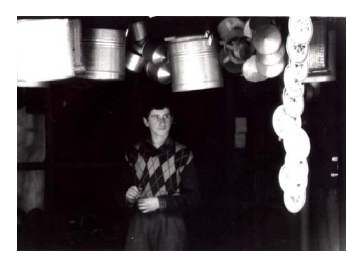
Fig. 3. Still from Look at me (1998) by Petek Berksoy.