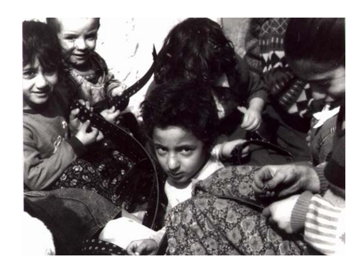
Fig. 4. Still from Look at me (1998) by Petek Berksoy.