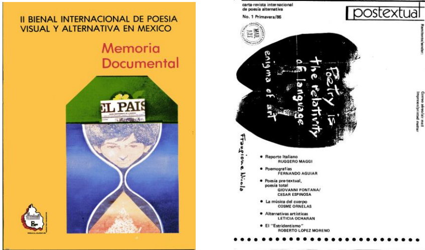
Fig. 2. Cover of the catalogue of the II International Biennial of Visual and Experimental Poetry, October 1987, México City: Departamento del Distrito Federal 56 pp.