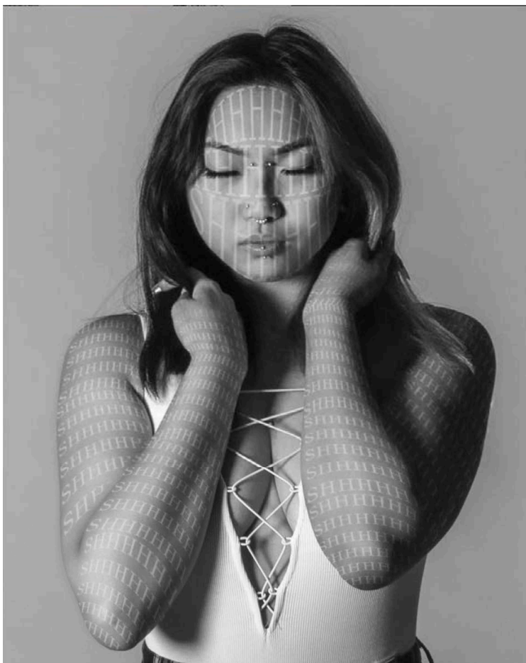
Figure 1: Image posted by @megan.keun

bodiment constructs the ability to negotiate agency and visibility for both the personal and the collective, as well as performativity in opposition to online and offline oppressive structures (Gajjala; Bhatia). In addition to the resistance, she displays immense vulnerability and precarity in her post that emerges in her desire to speak for herself, and in her admission of shame and hurt caused by otherization in