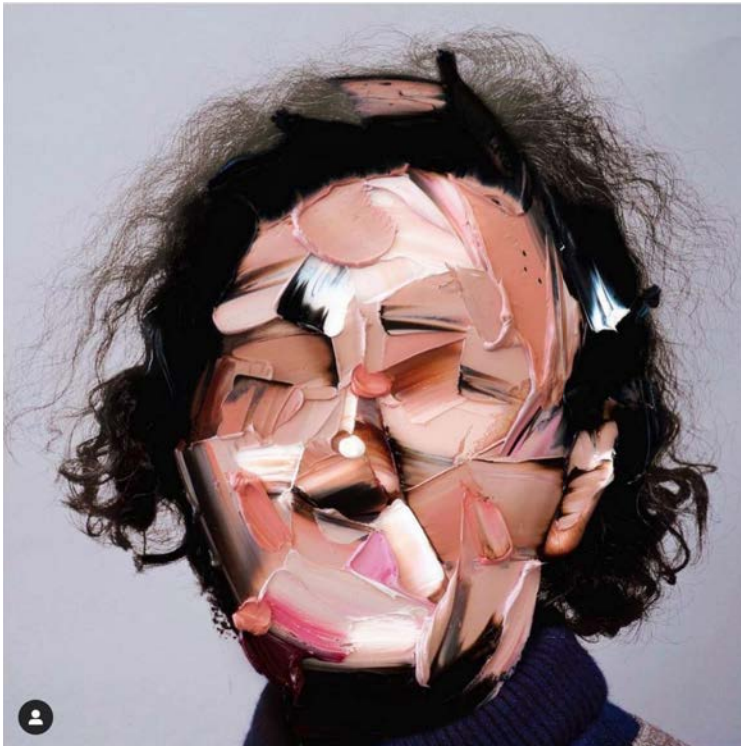
Figure 2: Image by @joeyunlee

her country. Similarly, the post below also stands for the collective Asian-American resistance against the dominant structures of whiteness.