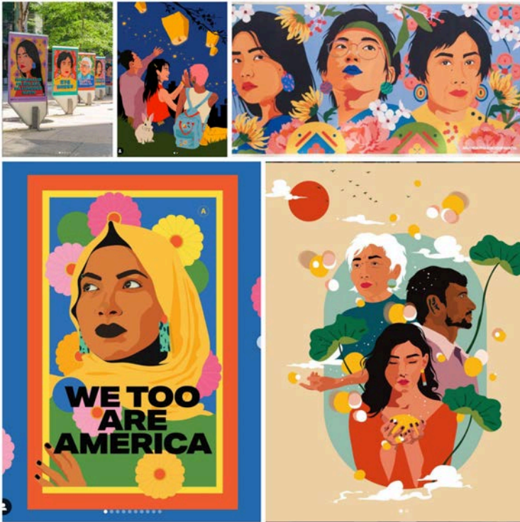
Figure 5: Instagram Images: Courtesy of Amanda Phingbodhipakkiya (@alonglastname)

The above image showcases various installations across the city as well as a magazine cover that prominently features Asian-Americans as well as Pacific Highlanders through art. For one of the city's many installations, represented by the first image above, Amanda writes: