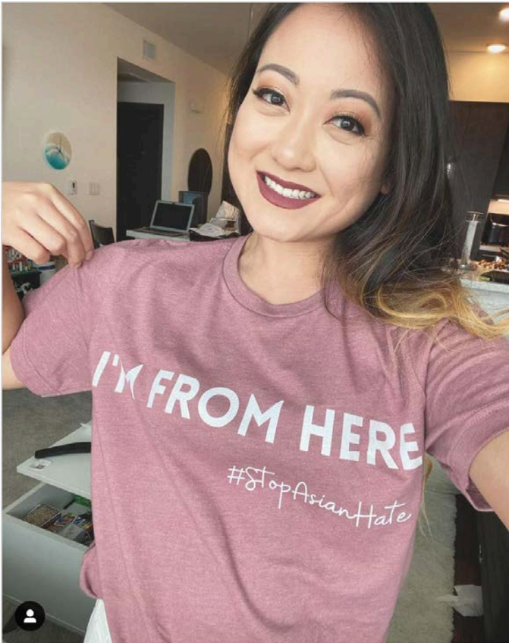
Figure 3: Image posted by @alicynreikoart

committed to it! I love how rich my background is and the food is GREAT!"