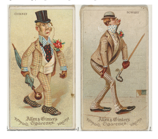
Figure 7: "Cockney" and "Bowery" from World's Dudes series (N31) for Allen & Ginter Cigarettes, 1888, Commercial color lithographs, 7 x 3.8 cm each, The Jefferson R. Burdick Collection, Gift of Jefferson R. Burdick, Metropolitan Museum of Art. http://www.metmuseum.org/art/collection/search/411306, http://www.metmuseum.org/art/collection/search/411240

like the players he coached, he uses his body as capital. This self-awareness of sartorial performance has a long history: Monica L. Miller identifies it in Black dandyism (219), its roots in the dress of the working classes, diasporic Africans, and sports figures of the early-20<sup>th</sup> century. Even earlier than that, the swells, mashers, and dudes of the 19<sup>th</sup> century were working-class men who dressed in upper-class styles, often in highly patterned and heavily accessorized suits to attract attention. These men were associated with various disruptions of middle- and upper-class social norms, with their affected clothing, slangy speech, preoccupation with leisure