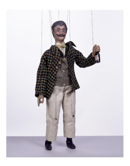
Figure 6: Tiller family marionette company, marionette representing a young 'masher' brandishing a beer bottle, 1870 to 1890, carved wood with paint and fabric, 71 cm, Victoria and Albert Museum. https://collections.vam.ac.uk/item/057558/marionette-tiller-family-marionette/

like the players he coached, he uses his body as capital. This self-awareness of sartorial performance has a long history: Monica L. Miller identifies it in Black dandyism (219), its roots in the dress of the working classes, diasporic Africans, and sports figures of the early-20<sup>th</sup> century. Even earlier than that, the swells, mashers, and dudes of the 19<sup>th</sup> century were working-class men who dressed in upper-class styles, often in highly patterned and heavily accessorized suits to attract attention. These men were associated with various disruptions of middle- and upper-class social norms, with their affected clothing, slangy speech, preoccupation with leisure