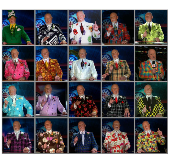
Figure 1: "The many suits of Canadian hockey commentator held by a bar, and mono- Don Cherry,"

Unlike some celebrities who assemble their outfits from available ready-to-wear garments, Cherry's suits are not off-the-rack. Starting in 1985, Cherry's suits were custom-made by Frank Cosco, an experienced Toronto tailor to professional athletes, until shortly before Frank's death in 2007. Since 2010, Cherry's main tailor has been John Corallo at the North Toronto boutique The Coop (Deacon). The bespoke