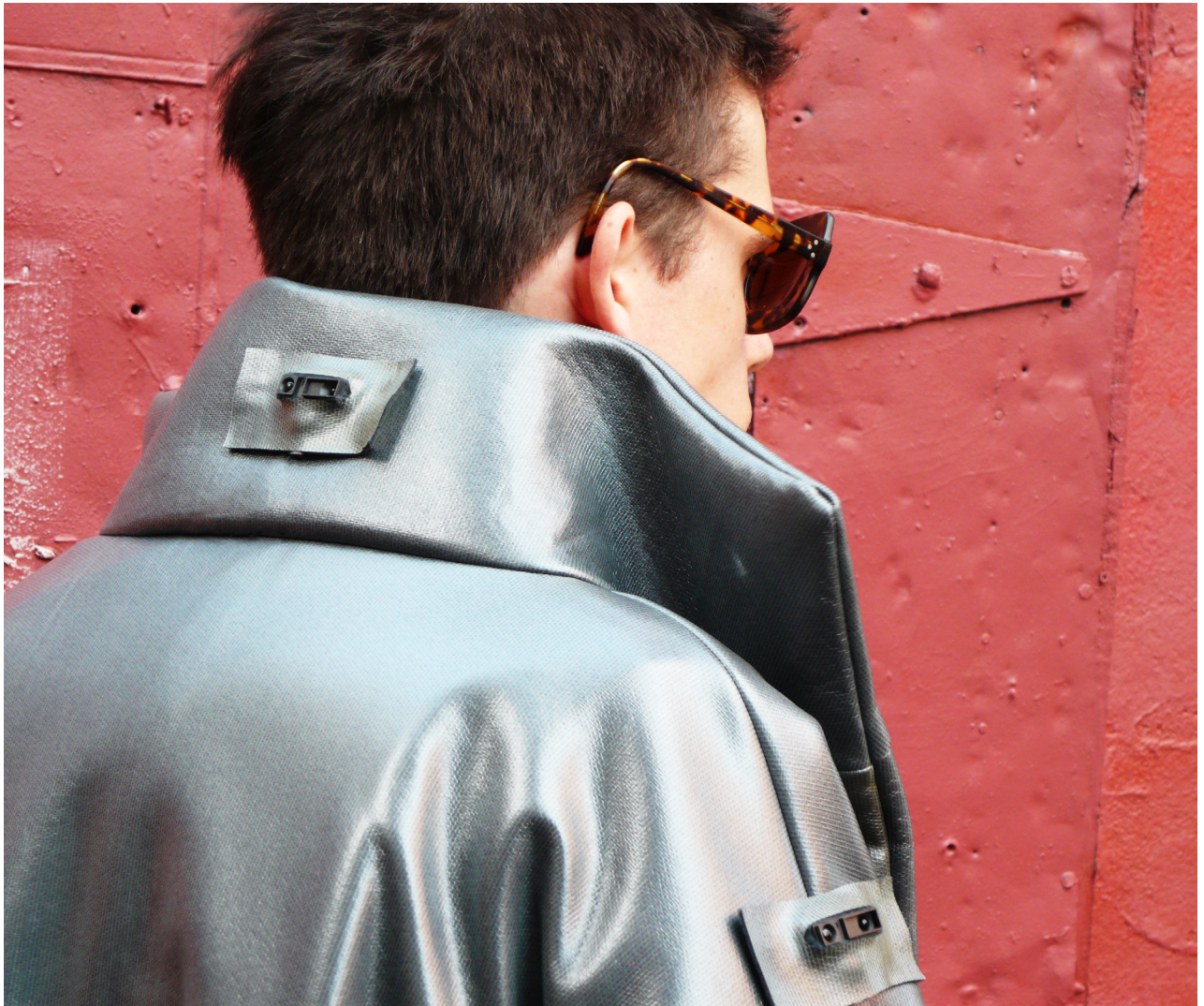
Barking Mad, Proximity sensors, speakers, dog barks, 2010