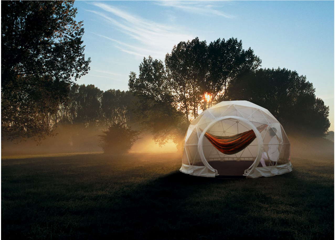
Oneiric Lab - public daydreaming unit 1, copper woven hammock, geodesic dome, observer, 2014