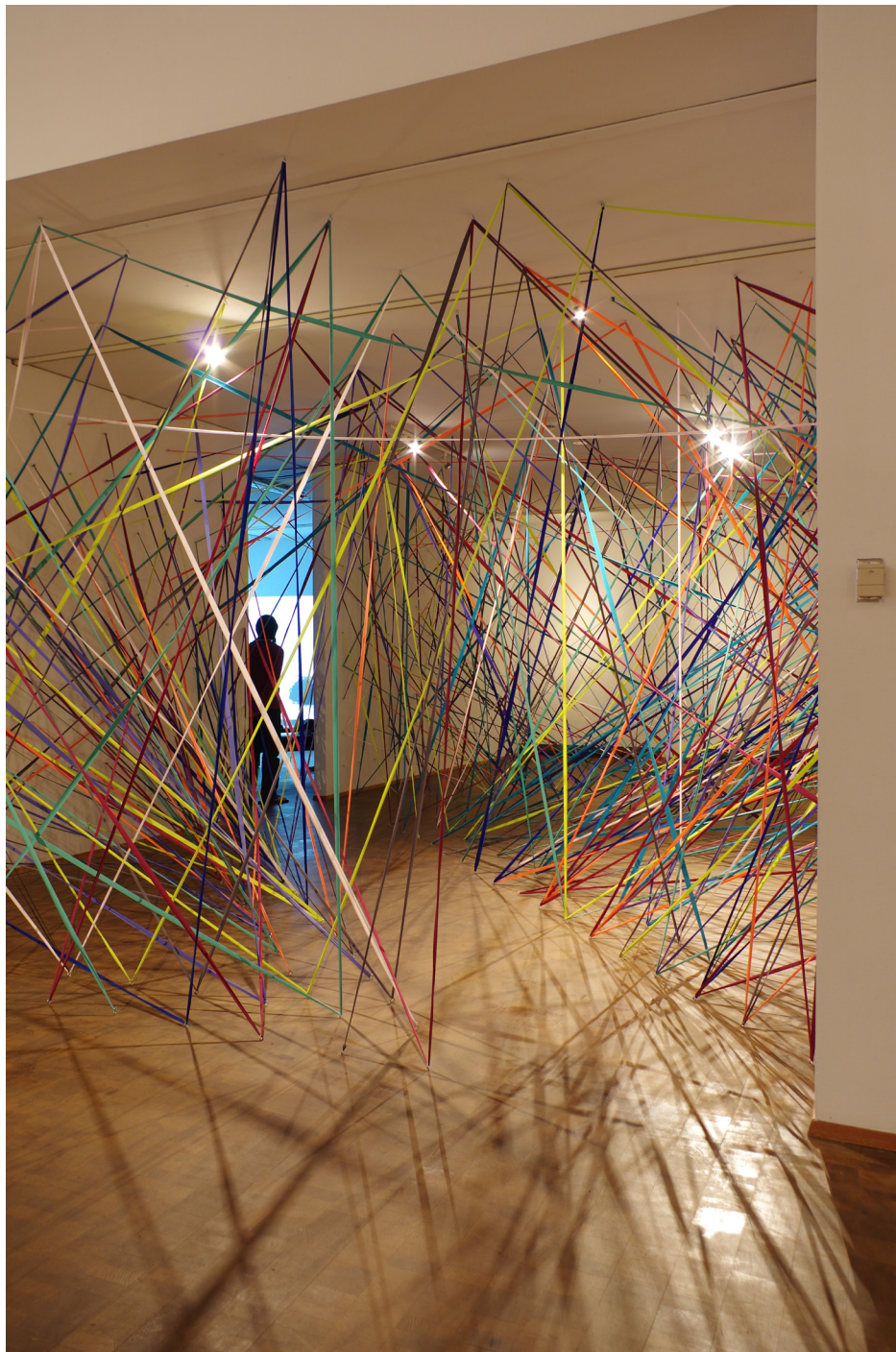
Distributed Networks, Upcycled textile waste, Western Gallery Washington, 2017