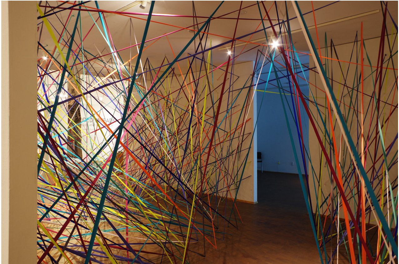
Distributed Networks, Upcycled textile waste, Western Gallery Washington, 2017