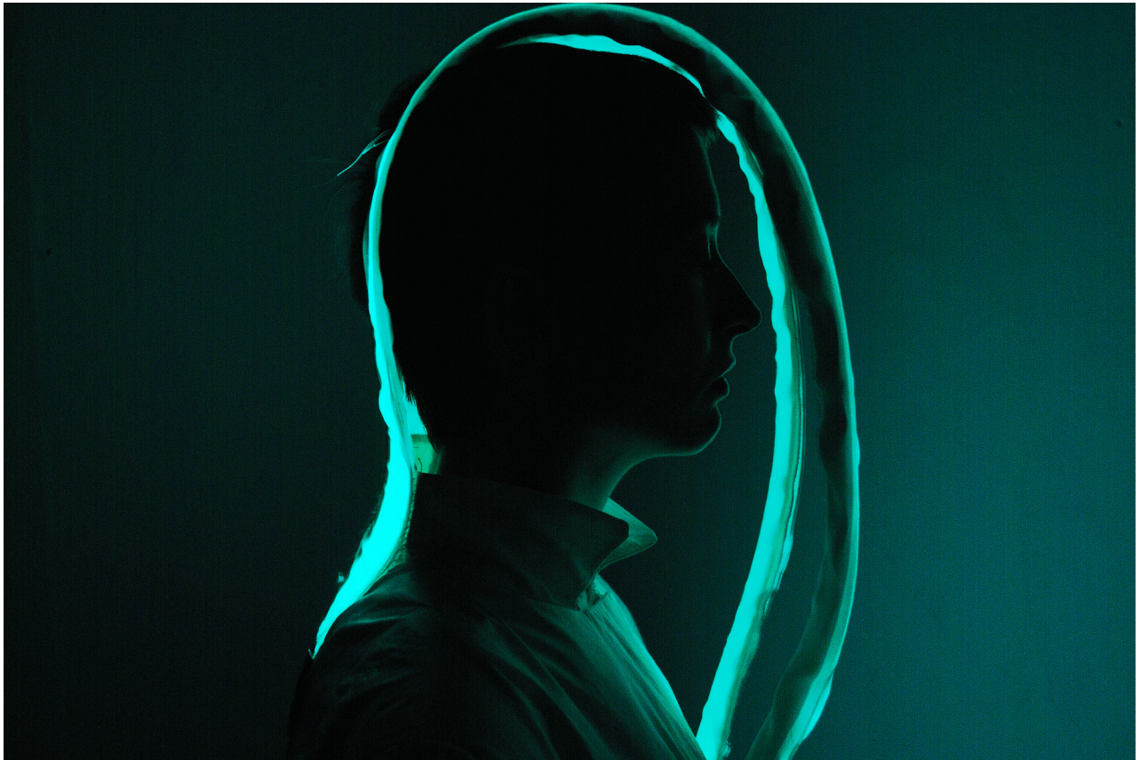
Electric Skin, breath, silk, silkscreened electroluminescent panels, electricity, Vancouver Olympics 2010