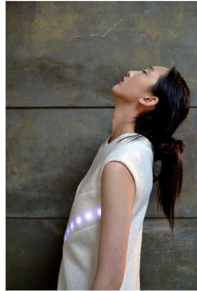
Electric Heart Absent beloved, heart beat, pulse oximeter, leds, iphone app 2014