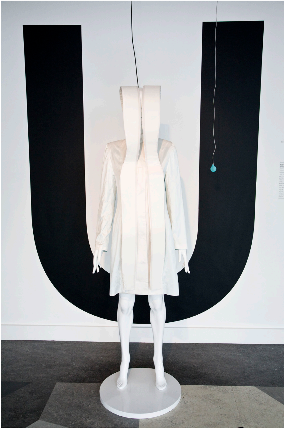
Electric Skin, breath, silk, silkscreened electroluminescent panels, electricity, Science Gallery, Dublin, 2011