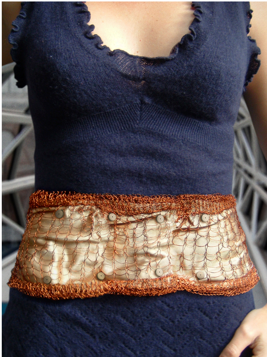
Felt, copperwoven wire, mp3, micromotors, 2008