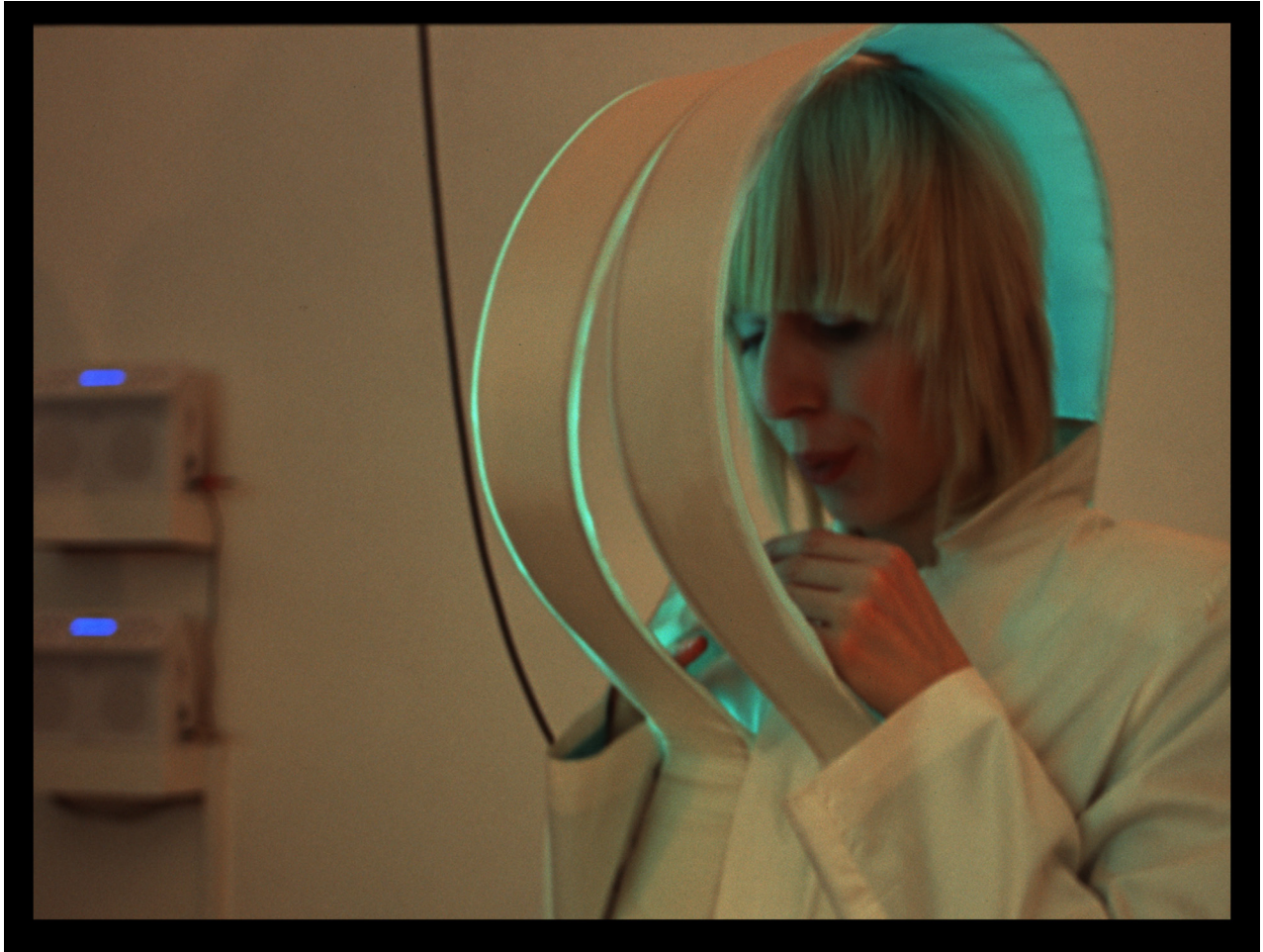
Electric Skin, breath, silk, silkscreened electroluminescent panels, electricity, Woburn Square 2007