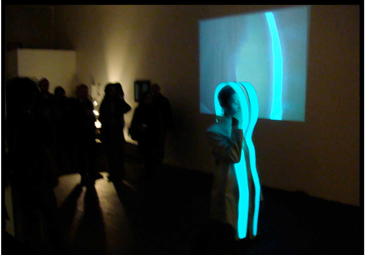
Electric Skin, breath, silk, silkscreened electroluminescent panels, electricity, Backgallery Project Vancouver 2009