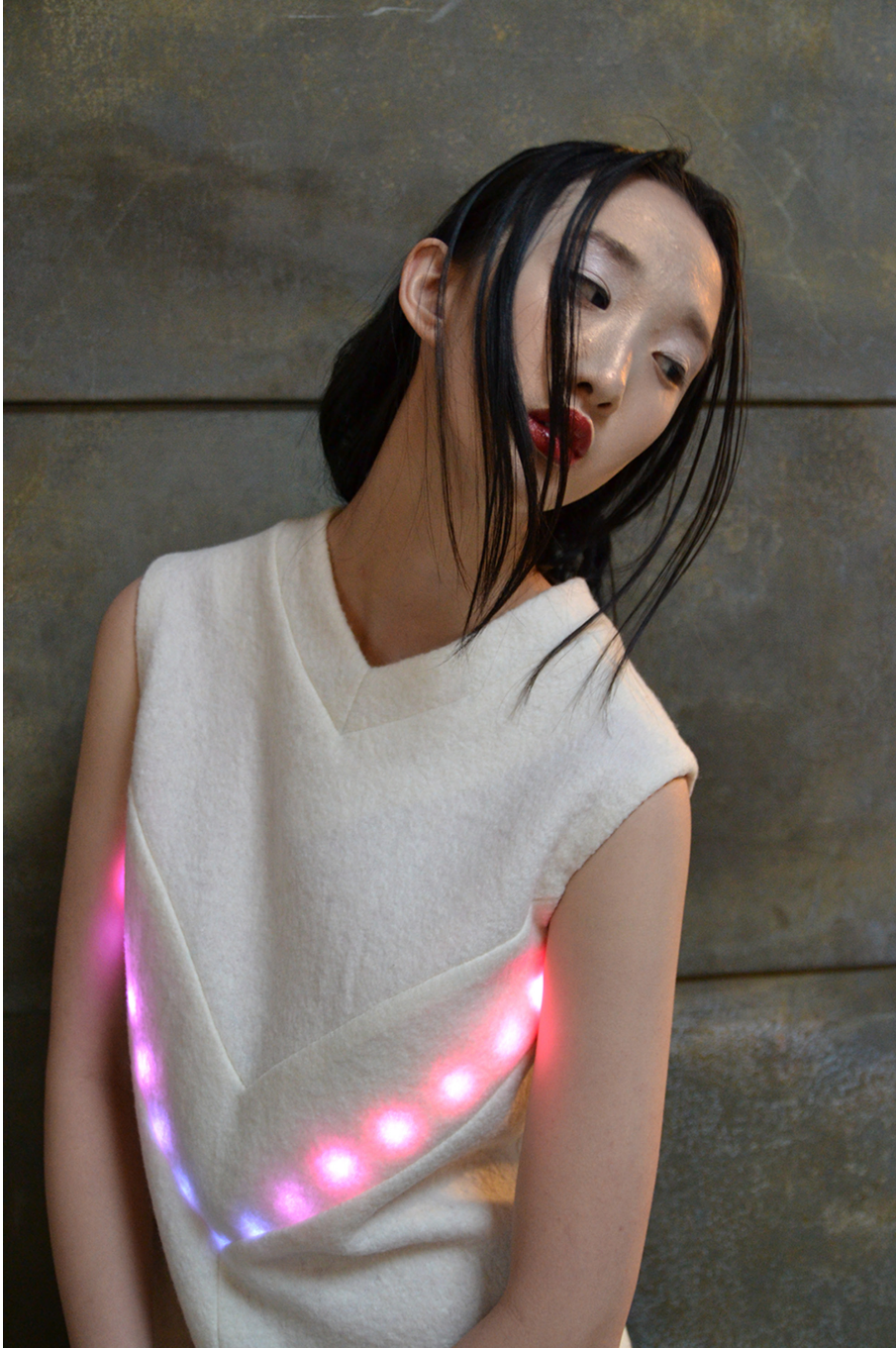
Electric Heart Absent beloved, heart beat, pulse oximeter, leds,iphone app 2014