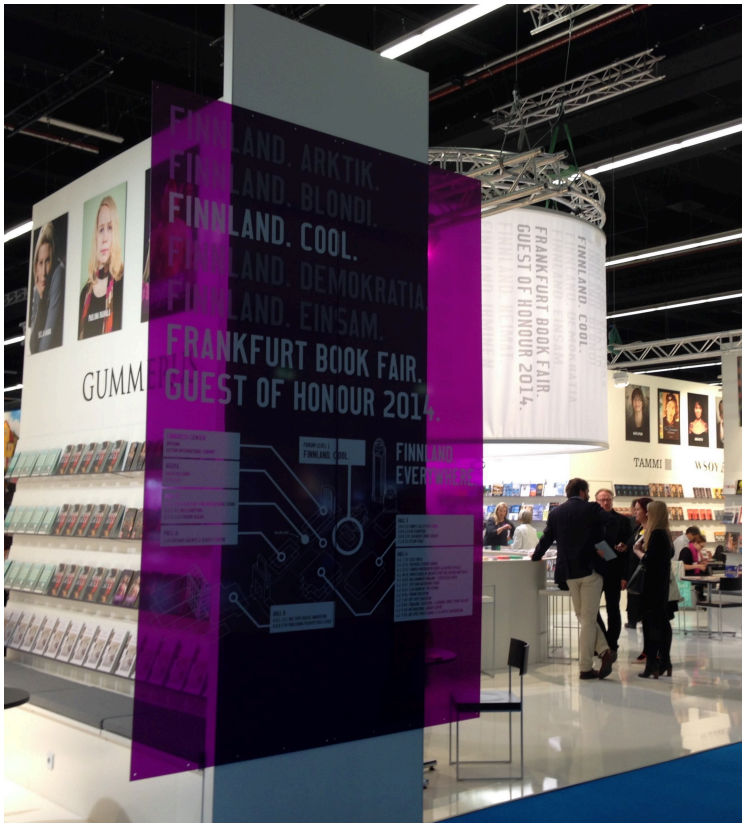
Figure 2: Finnish stands at the Frankfurt Book Fair 2014

This article is based on a study I did for my dissertation FINN- LAND.COOL. – Zwischen Literaturexport und Imagepflege. Eine Un- tersuchung von Finnlands Ehrengastauftritt auf der Frankfurter Buchmesse 2014 ( FINN- LAND.COOL. – Between Literature Export and Image Cultivation. A Study of Finland's Guest of Honour Presentation at the Frankfurt Book Fair 2014 ). In this article, I observe Finland's performance as the Guest of Honour to find out what kind of a plat- form the Frankfurt Book Fair is and what the Guest of Honour status