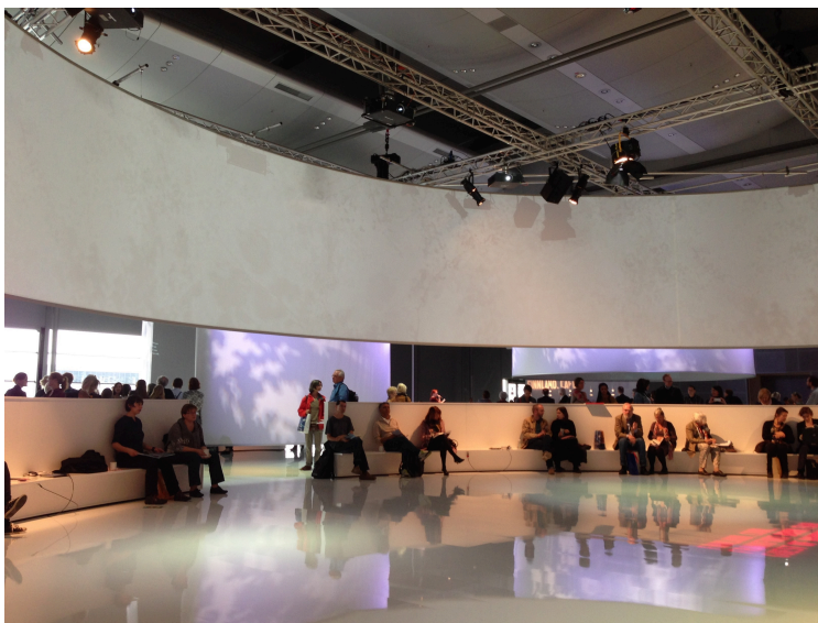
Figure 3: The Finland.Cool. pavilion in 2014.

Finland struggles with the fact that other Nordic countries have managed their literature exports better. In Germany, which is often seen as a gateway to other European book markets, Swedish literature, for example, is among the ten most translated literatures ( Buch und Buchhandel ). Even though German traditionally is the most translated language for Finnish literature, Finland had barely reached the top-20 most-translated languages in Germany before the Guest of Honour presentation (“Herkunftssprachen der Übersetzungen für den deutschen Buchmarkt im Jahr 2015”). This stems from the rather short history of Finland’s cultural exports. In the international literary field where the older literatures have gained a more central position, Finnish literature is still at the periphery. The importance of cultural exports was for a long time not recognized in Finnish cultural politics. The significance of cultural exports for building the image of the country was not taken seriously and, therefore, was not given economic value (Siikala 220–22).