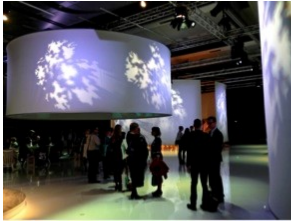
Figure 5: Finland's pavilion in the evening light.

“Finland is nature, pure and clear,” wrote the Frankfurter Allgemeine Zeitung newspaper after visiting the pavilion at the book fair (Hierholzer, translation mine). 1 The Finnish organisers deliberately avoided nation-branding and conveying Finland stereotypes and underlined the importance of literature, reading, and education in the presentation instead. Yet, the presentation was in the end still a form of nation-branding. The more the German media wrote about stereotypical Finland, the more the organisers went ahead and also cultivated this image.