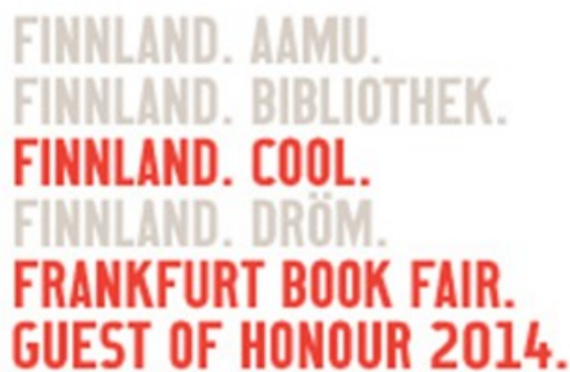
Figure 4: The Logo of the presentation

and literature under the slogan “Finland. Cool.” According to Finland’s strategy, the Frankfurt 2014 presentation was an export project not only for Finnish literature but also for Finland’s accomplishments in education and literacy (“Finland. Cool. Strategy.”). The aims given in the strategy were permanent growth in sales of translational rights, a tighter network among art and culture institutions, and a better-known Finland through the cultural program (“Finland. Cool. Strategy.”). In the presentation, the Finnish organization wanted to avoid a stereotypical approach to nation-branding.