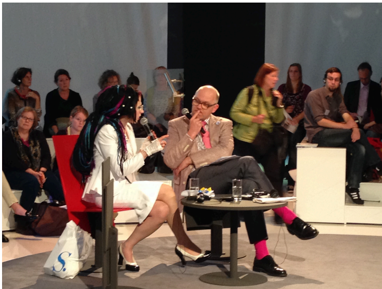
Figure 6: Sofi Oksanen at the Frankfurt Book Fair 2014.

focus is on a more international market, especially on the English-speaking area.