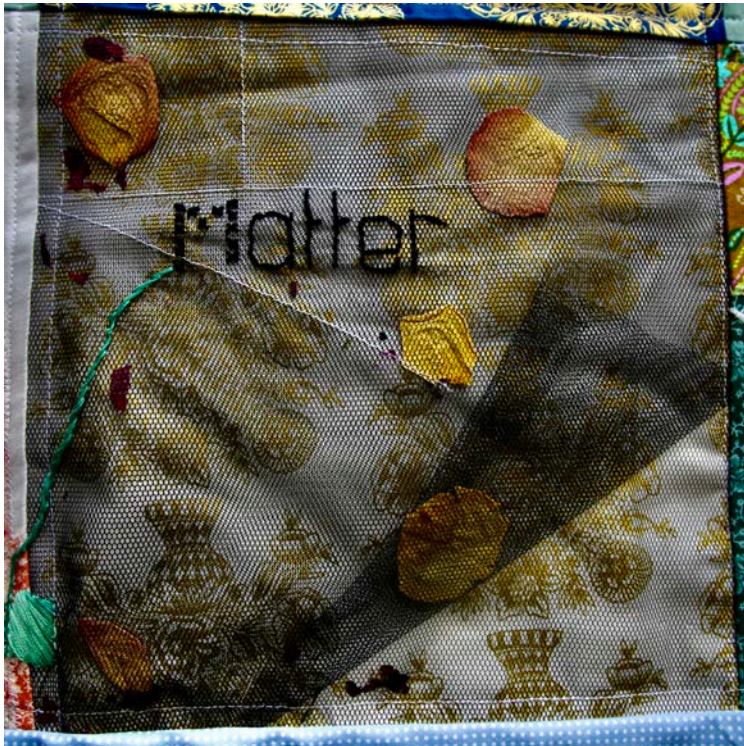
Figure 1: Matter. Corinna Peterken.