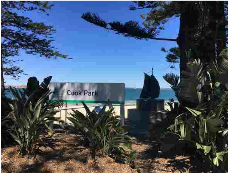
Figure 3: Looking towards the Heads of Botany Bay (Kamay) from Cook Park, Bayside Council, Sans Souci, 2020.

journalist Stan Grant, a Wiradjuri man, argued for historical accuracy. He contested the inscription on the statue, which states that Australia was discovered by Cook in 1770, a description that for him aligns with the national narrative of Australia's discovery by the British, and omits recognition of the country's Indigenous inhabitants. Intense debate followed this article, with some politicians sounding the alarm over the rewriting of history. Meanwhile, this example highlights how national imagery in Australia is undergoing a phase of contestation and enquiry about the meaning and connectiveness of national narratives (Giovanangeli and Snepvangers 2016).