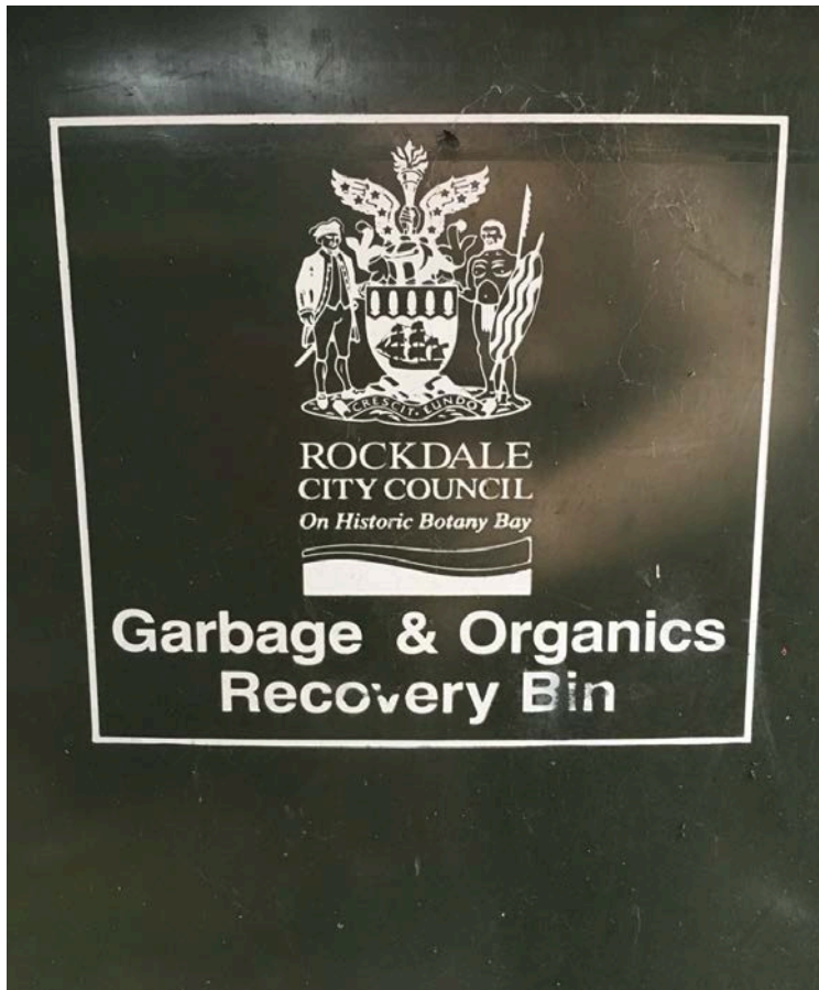
Figure 2: Image of Self in the Recovery Bin Logo from Kamay – (Botany Bay), 2020.