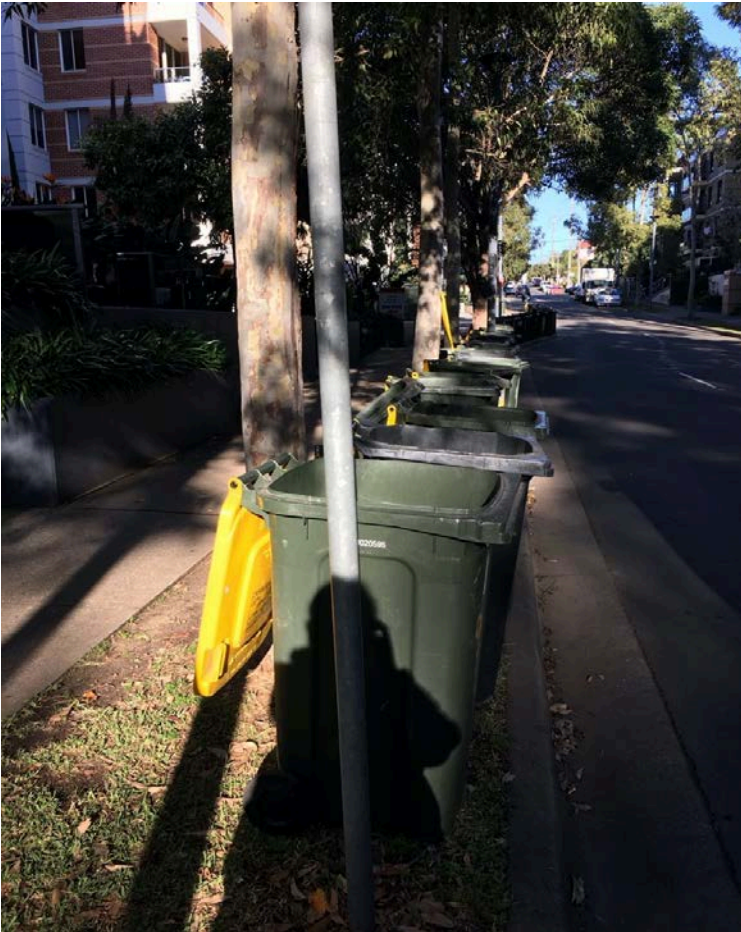
Figure 4: Image of Self in Row of Recycling Bins from Kamay – (Botany Bay), 2020. Image by the author.

ened my observations of daily procedures and historical tensions, especially stemming from the initial focus on my own garbage and recovery bin in my front yard. This grew to a communal interest. This is because the logo on my bin is repeated all over the suburb, and indeed the whole council area, thus reinforcing historical events from