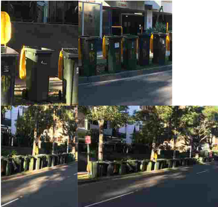
Figure 5: Filmic Cuts of Recycling Bins from Number 95, Streetscape in Kamay – (Botany Bay), 2020.

challenge to seriality as sameness, limiting the actions of individual bins, for example, as they are not generic and have social constructs that open the possibility of resistance and non-compliance. These are some of my initial thoughts on the sustainability of bin collection at the system-level, especially about the possibility of garbage recovery and what this might mean. Yet, I am grounded in the thought that these are garbage bins with little or no street appeal. Secondary to the bin itself is the logo, with its historical binaries and Captain Cook, so I am placing hope in questioning and even contradicting the original usage and intention of each object in this article.