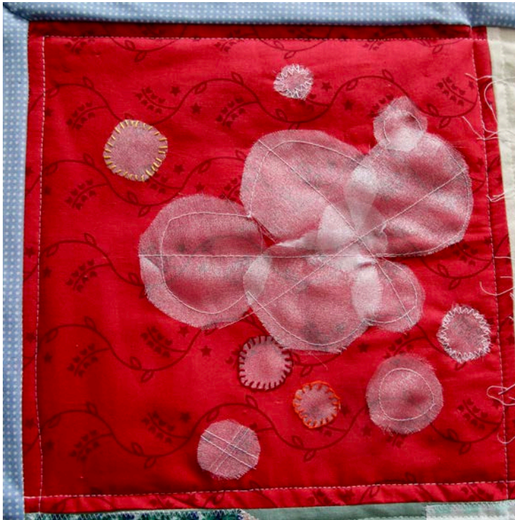
Figure 1: Pandemic bubbles. Corinna Peterken.