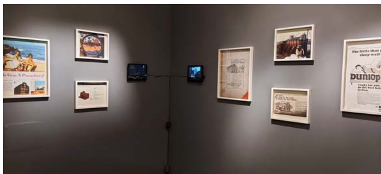
Figure 3: Wide View of (T)here is the Basilica (2021).

use images of the church to shill holidays and real estate in Goa. The title of the installation explores the distance between the cultural and historical “there” and “here” of the postcolonial nation and its colony, the centre and periphery. This is poignantly dramatized in Kandolkar’s use of a video segment that shows the Basilica as an emblematic representation of Goa, alongside floats epitomizing other states, in the annual Republic Day parade in New Delhi, India’s capital. If the Basilica is a symbol of Goa’s Portuguese past, situated as it is in the former capital of the now bygone Estado da Índia , then its simulacral reemergence in a national event celebrating the creation of the post-British Indian Republic collapses Goan history into a mainstream national narrative.