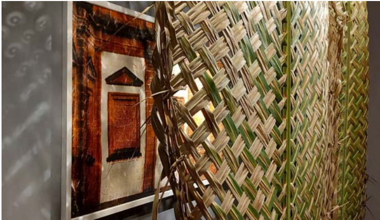
Figure 7: Side View of This is Not the Basilica! (2021).

drop of local materiality and historicity, one through which the artist gives his viewers the opportunity to reckon with past and present as they consider the Basilica's future. Recall that the Salazarist intervention that deplastered the Basilica in the 1950s created its modern-day look by, ironically, aging the building—a technological advancement in aid of de-modernizing its look. Reversing this trend, contesting its meaning-making, what might be achieved by experimenting with past traditions, reinvigorating them for a new take on modernity? Just as mollam could stand in for plastic tarpaulin as an environmentally sound option for protecting buildings against rainfall, so too could the reuse of once-traditional plaster give the Basilica a new lease on life.