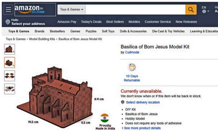
Figure 5: Detail from (T)here is the Basilica (2021).

An entire generation of Goans will have only known the Basilica in its present form, devoid of its once highly contrasting white plaster surfaces. And why should this be a problem? The lime cast which was removed during Castro’s renova-