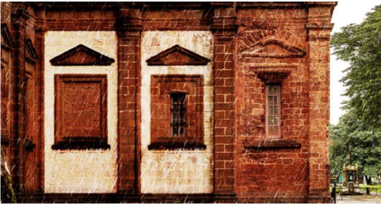
Figure 2: Uncovered Photo Detail from This is Not the Basilica! (2021).