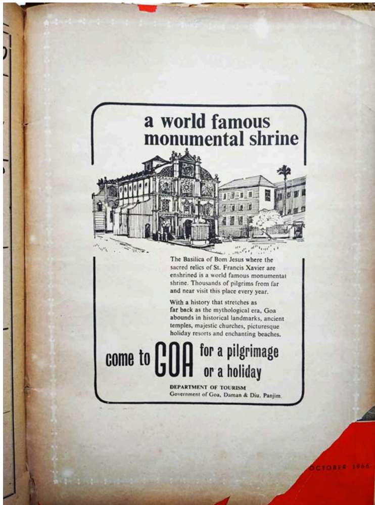
Figure 4: Detail from (T)here is the Basilica (2021).