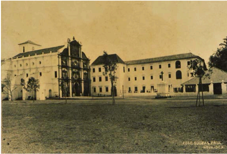
Figure 10: The Basilica of Bom Jesus (Old Goa), photographed in 1890 by Souza and Paul. Photo courtesy of Goa State Central Library.

of Xavier’s feast day, as well as a decadal exposition of his sacred remains. These events draw large crowds of Goans, an occurrence that Kandolkar declares,