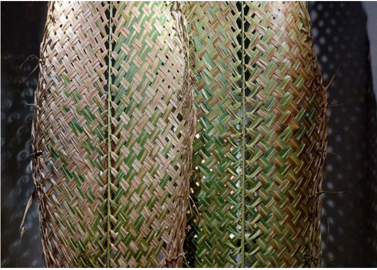
Figure 1: Woven Palm Detail from This is Not the Basilica! (2021).