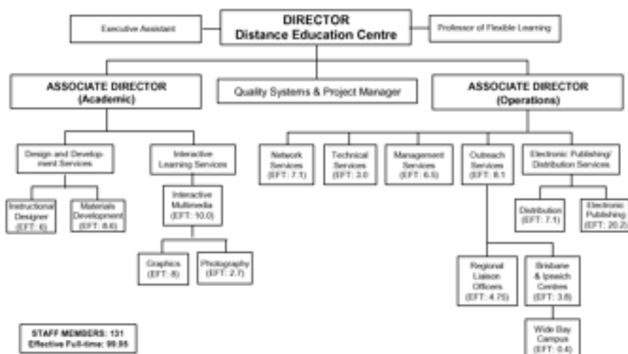
Figure 2: Staff Establishment of the USQ Distance Education Centre (Below/End)