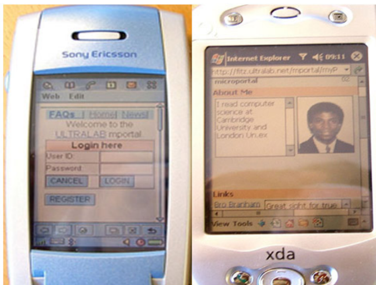
User login interface on a Sony Ericsson P800 mobile phone

Figure 2a , a snapshot of the user login screen on the P800. Figure 2b , an example of what the user sees when they first login.