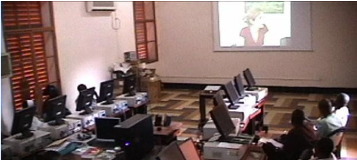
Figure 2. A partial view of the DE classroom setting at the UNFM-Bamako in Mali.